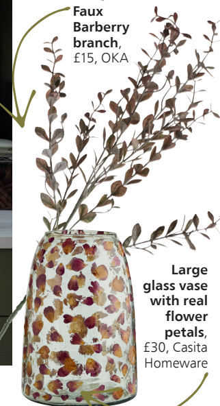
Faux Barberry branch, £15, OKA