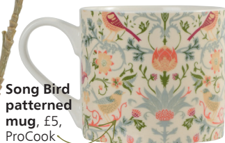
Song Bird patterned mug, £5, ProCook