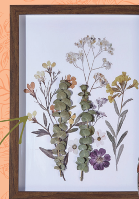
Hibernate real dried floral, £13, Matalan

Headboard upholstered in Treviso Smart Velvet, Baby Bombay in Citrus, £75 per m, Arley House