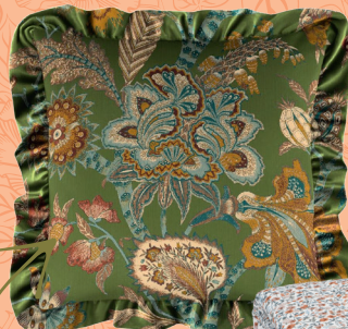
Baby Bombay cushion in Citrus with frill trim, £75, Arley House