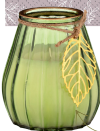
Hello Sunshine leaf glass citronella candle, £1.50, B&M