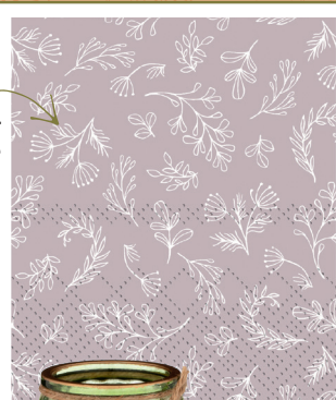
Rectangular Napkin in Rose Pattern, £2.90, Charlottes. shopping