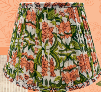
Octavia pleated cotton lampshade, from £75, Huddle Collection