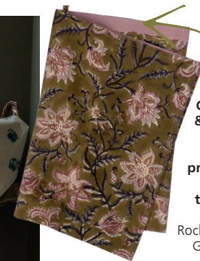
Olive Green & Pink Floral block printed tea towel, £17, Rockett St George