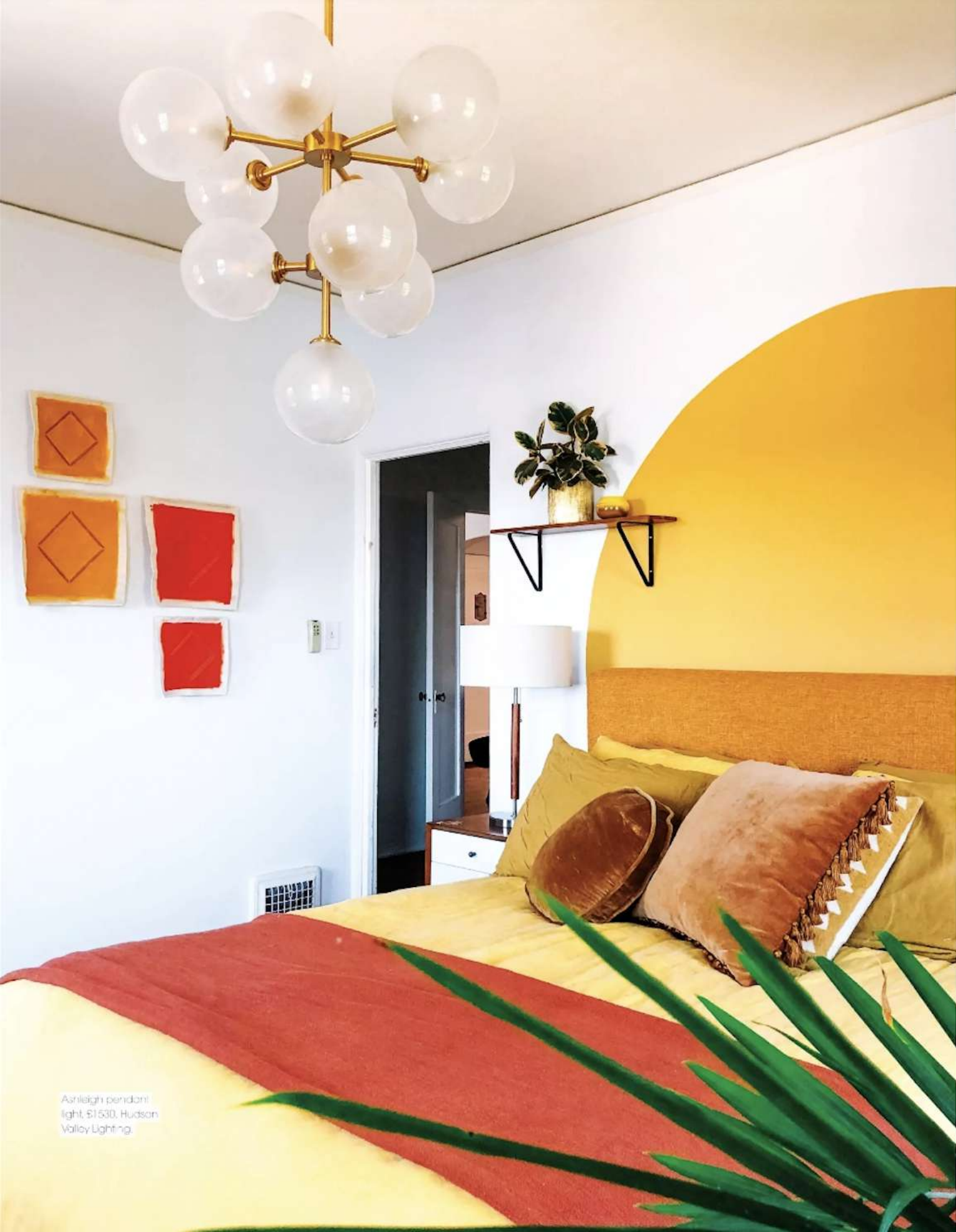
Ashleigh pendant light, $1530, Hudson Valley Lighting.