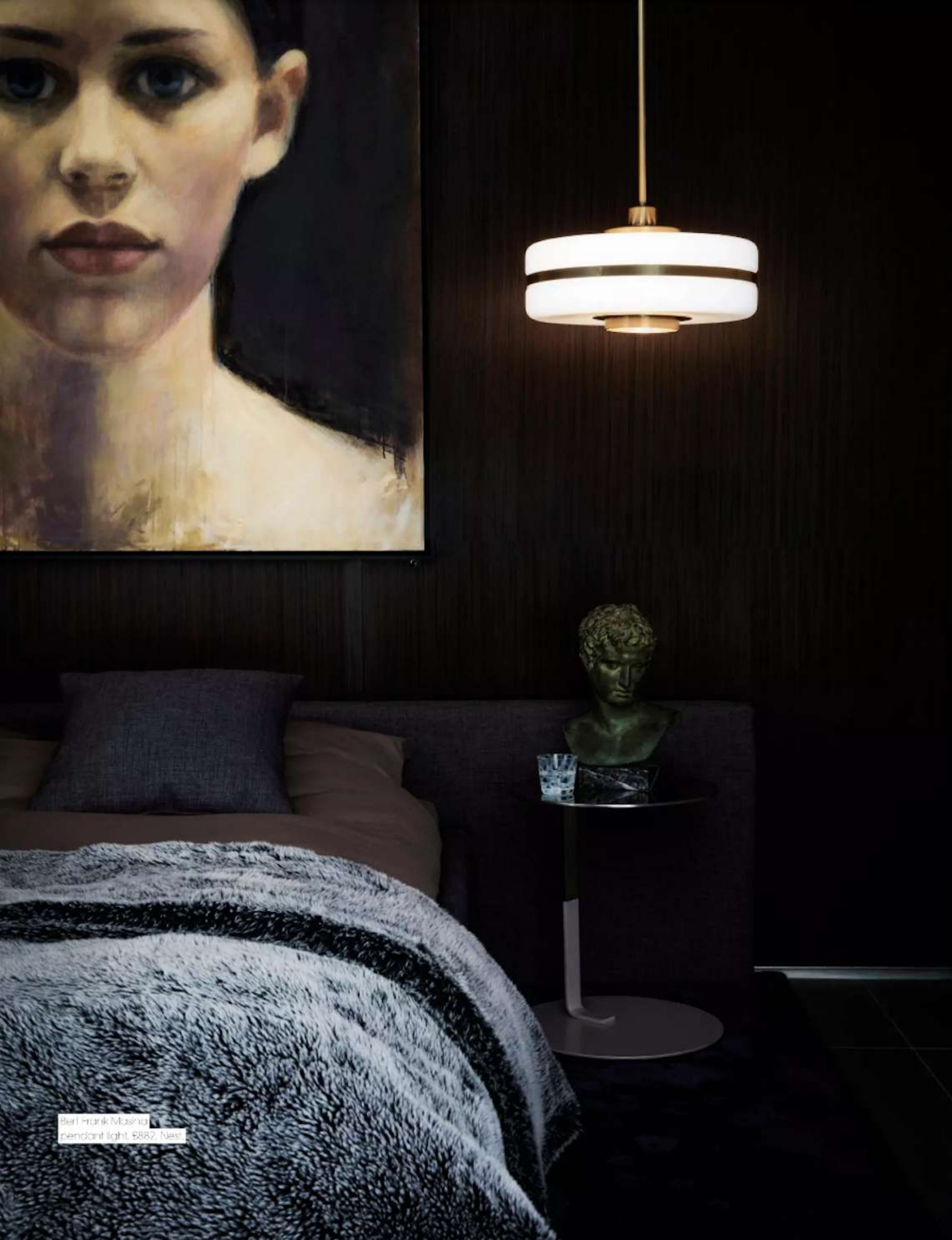
Bert Frank Masina pendant light, $882, Nest