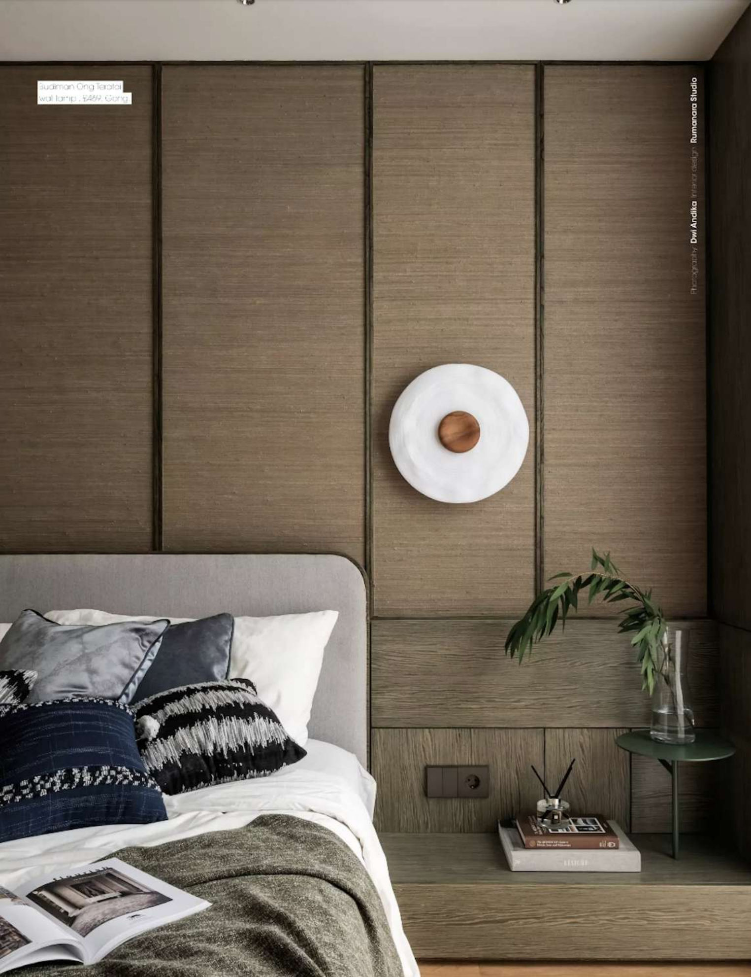
Interior design: Rumanara Studio