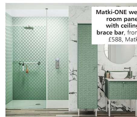
Matki-ONE wet room panel with ceiling brace bar , from £588, Matki

shower tray or shower floor for a real wet-room look. To make your bathroom stand out, the attractive wall brace bar with disc insert and minimal wall mount is customisable in a range of contemporary colour and metallic finishes, including silver, white, black and architectural bronze. As well as reducing costs, this wet room panel is easier to clean as it comes with a completely frameless base.