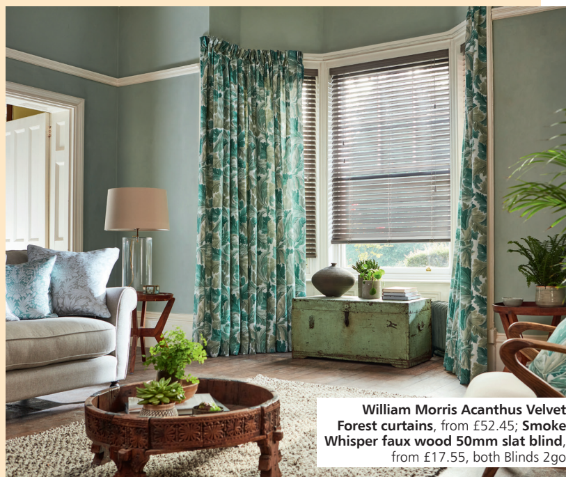
William Morris Acanthus Velvet Forest curtains , from £52.45; Smoke Whisper faux wood 50mm slat blind , from £17.55, both Blinds 2go

the window. These innovative blinds are designed to protect your home from the winter chills, while helping to reduce your energy bills. Layering blinds and curtains is also a great way to create a snug space. A combination of wooden Venetian blinds and curtains or Roman blinds and curtains make stylish and practical options for winter. Choosing thermal lining on curtains, Roman blinds or roller blinds will add insulation, helping to reduce heat loss and bring a cosy feel to a room in an instant. Plus, they allow you to experiment with colour, pattern and texture and show your individual style, while keeping the chill away.