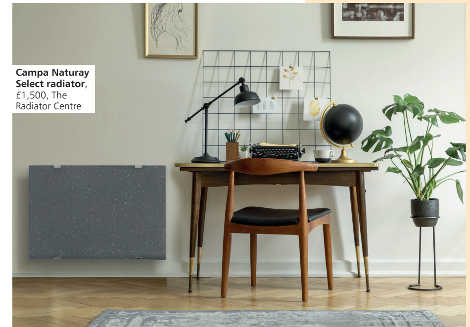
Campa Naturay Select radiator , £1,500, The Radiator Centre

be considered part of a range of energy-saving initiatives, as you won't be heating an empty house unnecessarily.