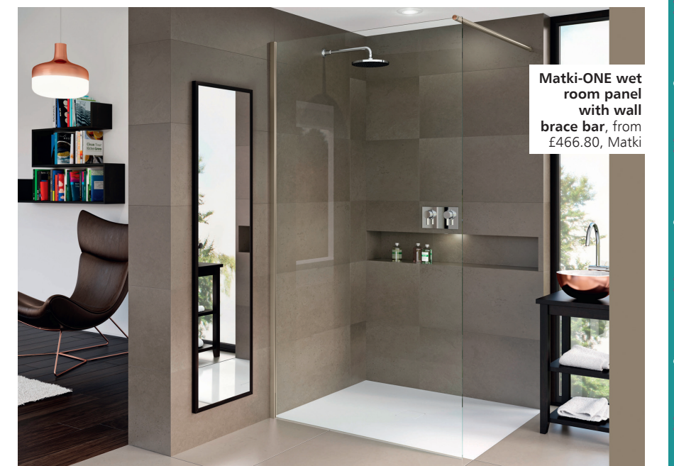
Matki-ONE wet room panel with wall brace bar , from £466.80, Matki