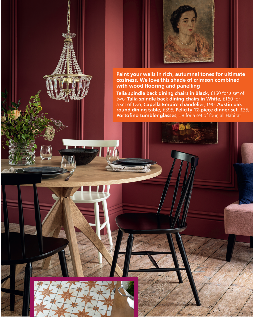
Paint your walls in rich, autumnal tones for ultimate cosiness. We love this shade of crimson combined with wood flooring and panelling Talia spindle back dining chairs in Black, £160 for a set of two; Talia spindle back dining chairs in White, £160 for a set of two; Capella Empire chandelier, £90; Austin oak round dining table, £395; Felicity 12-piece dinner set, £35; Portofino tumbler glasses, £8 for a set of four, all Habitat