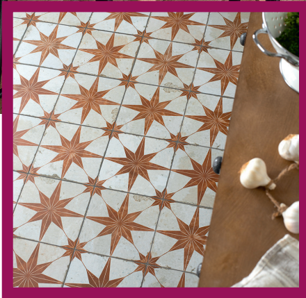
◀ Nothing says autumn quite like burnt orange – these star tiles will look stylish all year round, too Scintilla Paprika Orange Star pattern tiles, £19.95 per sq m, Walls and Floors