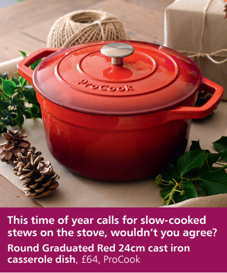
This time of year calls for slow-cooked stews on the stove, wouldn't you agree? Round Graduated Red 24cm cast iron casserole dish, £64, ProCook

Clockwise from top left: Grey Battery Wax authentic flame candles in smoked glass cylinder, £26.99 for a set of three, Festive Lights. Belgravia velvet armchair in Burnt Orange, £399, Cult Furniture. Autumn Maple table centrepiece , £40, Sophie Allport. Orange Uniformed Geometric Modern Pattern Furnishing velvet upholstery fabric, £156.99 per metre, Yorkshire Fabric Shop.