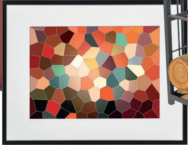
From left to right: Lined rattan storage baskets , from £25, Marquis & Dawe. Primer Red wall paint , £21.95 per 1L, Annie Sloan. Orange geometric abstract stained-glass wall art print , from £18, Claude & Leighton. Log holder and fireside set , £145, Cox & Cox