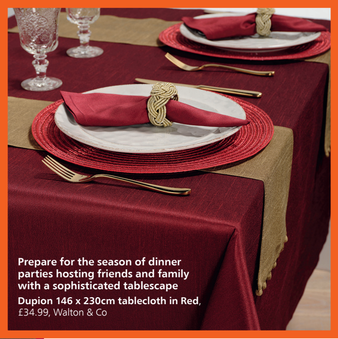
Prepare for the season of dinner parties hosting friends and family with a sophisticated tablescape Dupion 146 x 230cm tablecloth in Red, £34.99, Walton & Co