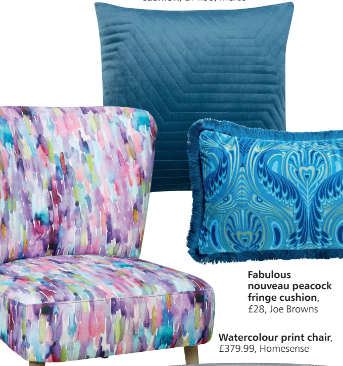
Fabulous nouveau peacock fringe cushion, £28, Joe Browns