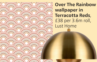
Over The Rainbow wallpaper in Terracotta Reds, £38 per 3.6m roll, Lust Home