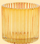
Amber fluted glass tea light holder, £1, Primark