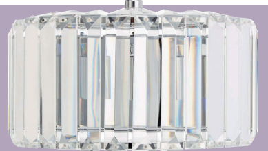
Laura Ashley Fernhurst wall light in polished chrome glass, £75, dār lighting