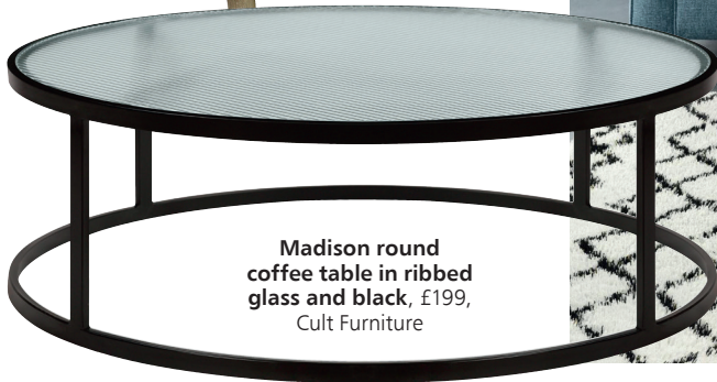
Madison round coffee table in ribbed glass and black, £199, Cult Furniture