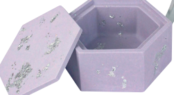
Nine Angels pastel lilac & silver jesmonite hexagon trinket box, £18, And So To Shop