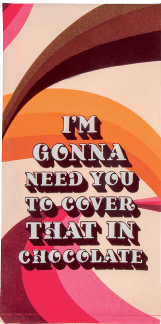
Cover in Chocolate tea towel, £11, Red Candy

Upgrading old chairs with a fresh lick of paint can keep them looking cool for years to come Chalk paint in Antoinette, Barcelona Orange, Athenian Black and English Yellow , £21.95 per 1L each; Wall paint in Old White , £41.95 per 2.5L, all Annie Sloan