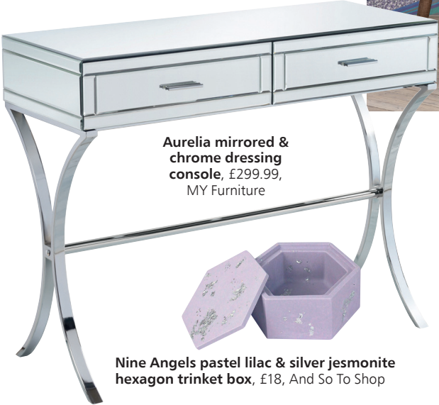
Aurelia mirrored & chrome dressing console, £299.99, MY Furniture