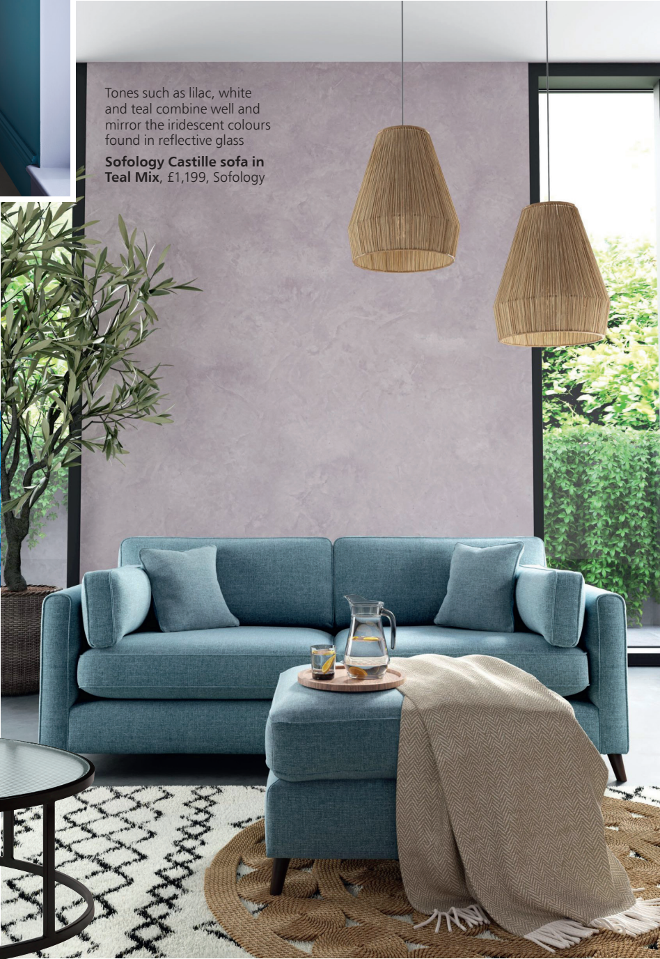
Sofology Castille sofa in Teal Mix, £1,199, Sofology

Tones such as lilac, white and teal combine well and mirror the iridescent colours found in reflective glass