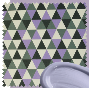
Monica Geometric pattern printed soft chenille designer fabric, £19.99 per m, Yorkshire Fabric Shop