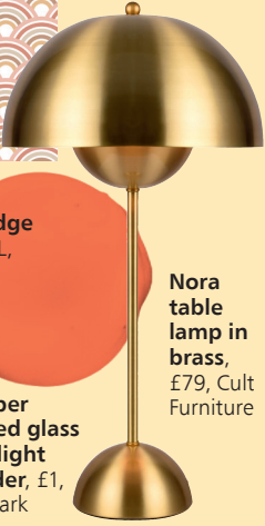
Nora table lamp in brass, £79, Cult Furniture

Layer velvet cushions and soft rugs in this season's colours to create a cosy look