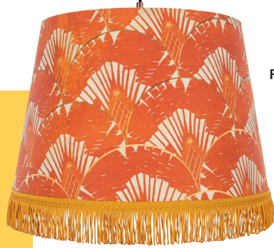
Ravenala orange lampshade, £180, Mindthegap

The Seventies is a decade that keeps coming back to the present day – and for good reason. Rich mustard and orange tones bring warmth into our homes when we need it most and those distinct retro patterns instantly add character to any space. If you like the look of this trend but are hesitant to pick up a bright paint brush, start small by adding in a few key pieces such as a statement upholstered chair, a few scattered cushions, or a couple of nostalgic accessories. Ready to go all out? Opt for a feature wall in a funky pattern for real wow-factor, and pair with equally bold accessories.