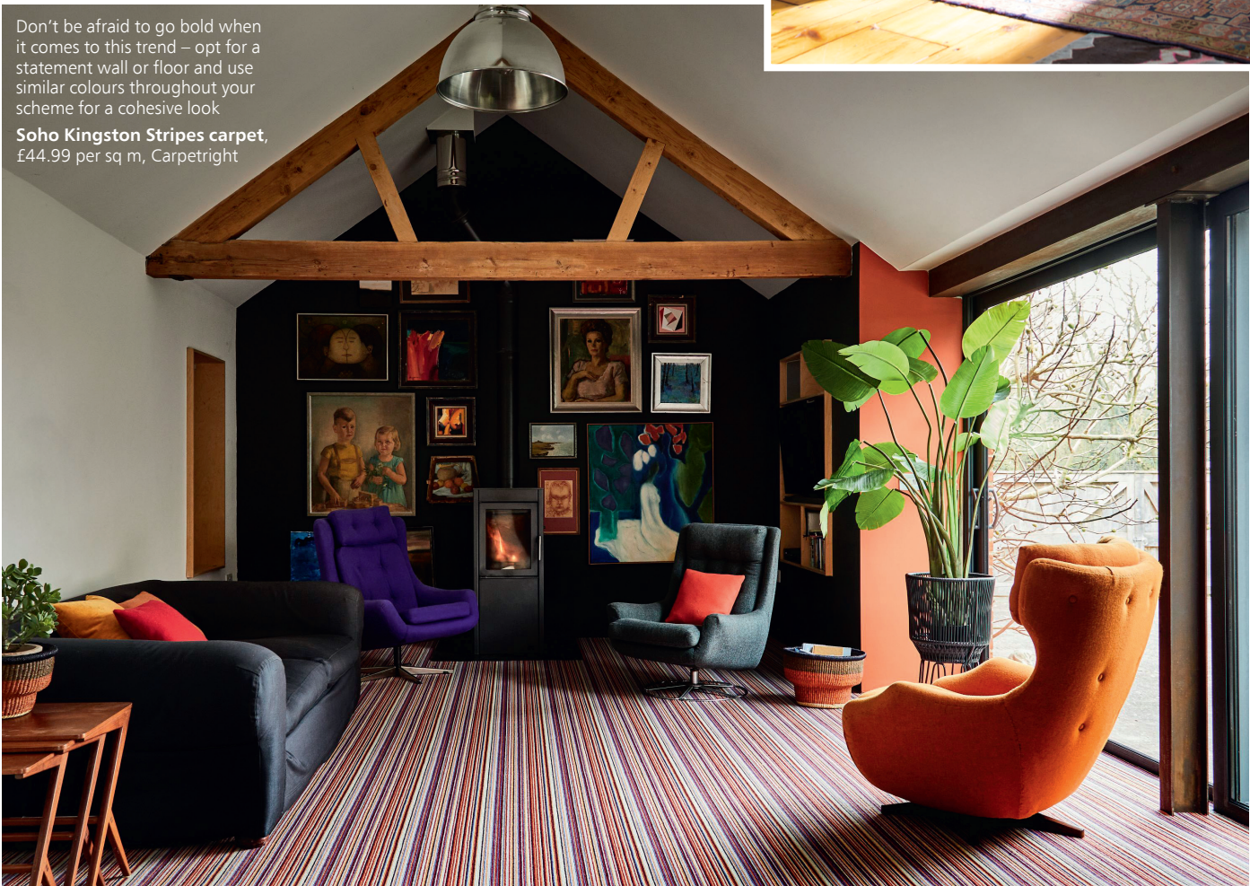
Soho Kingston Stripes carpet , £44.99 per sq m, Carpetright

Don't be afraid to go bold when it comes to this trend – opt for a statement wall or floor and use similar colours throughout your scheme for a cohesive look