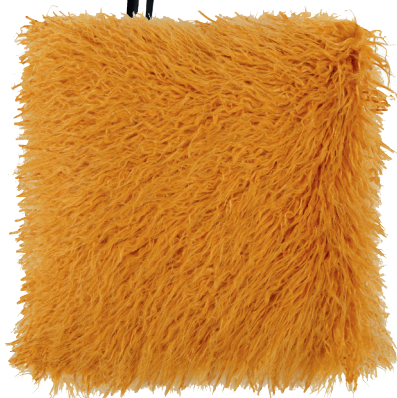
Ochre Mongolian faux-fur cushion , £28, Julian Charles