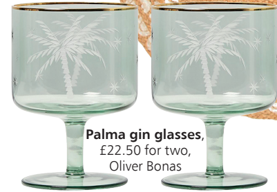
Palma gin glasses , £22.50 for two, Oliver Bonas