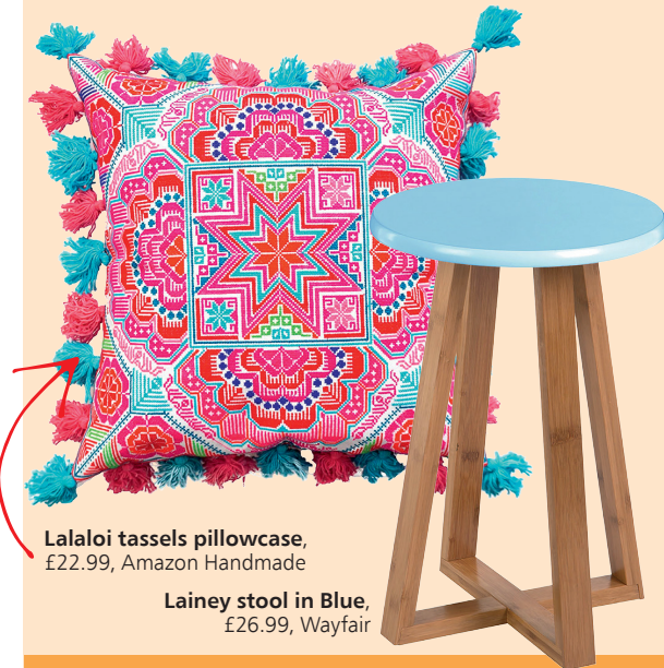
Lalaloi tassels pillowcase , £22.99, Amazon Handmade

Layer a selection of playful patterns and colourful cushions together in warm hues for a Mediterranean look Dried flowers in a rattan basket , £8; wall art , £3.50; candle , £3.50; dried flower terrarium , £3; dried flower bunch , £3; photo frame , £3.50; duvet cover set , £11; cushions , from £3.50 each, all Primark