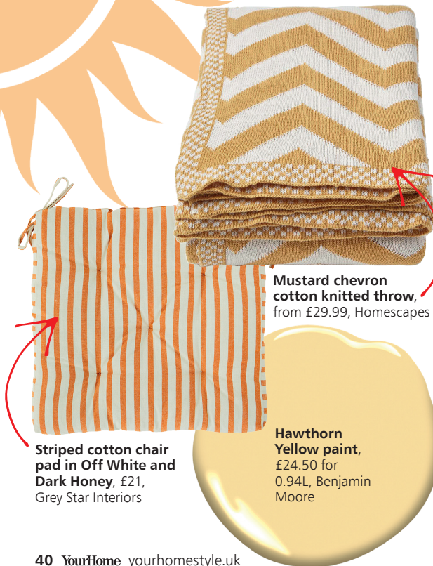
Mustard chevron cotton knitted throw , from £29.99, Homescapes