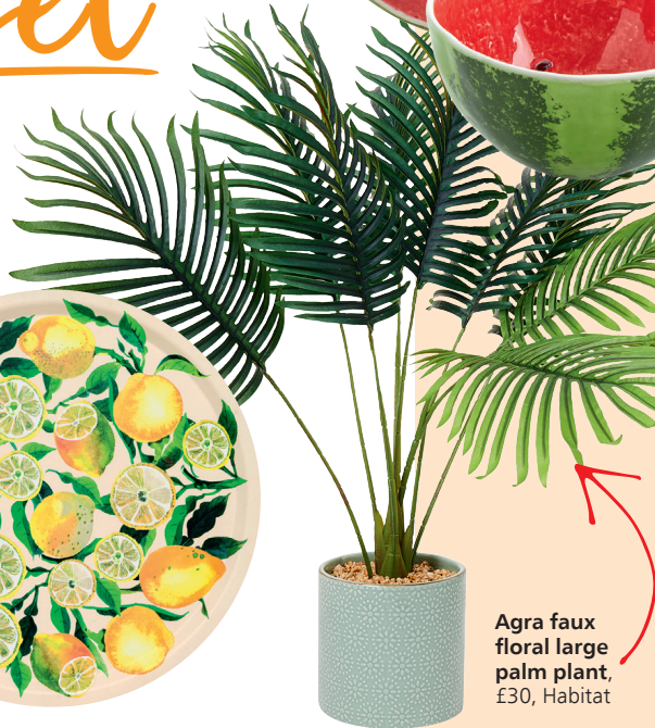
Agra faux floral large palm plant , £30, Habitat