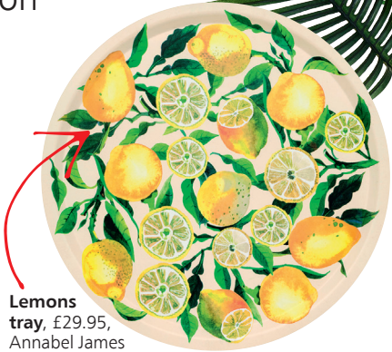
Lemons tray , £29.95, Annabel James