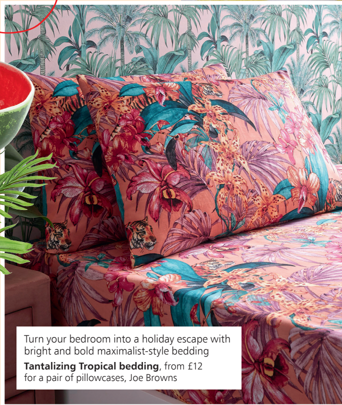
Turn your bedroom into a holiday escape with bright and bold maximalist-style bedding Tantalizing Tropical bedding , from £12 for a pair of pillowcases, Joe Browns