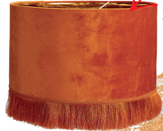
Orange velvet fringed lampshade , £24.99, Homesense