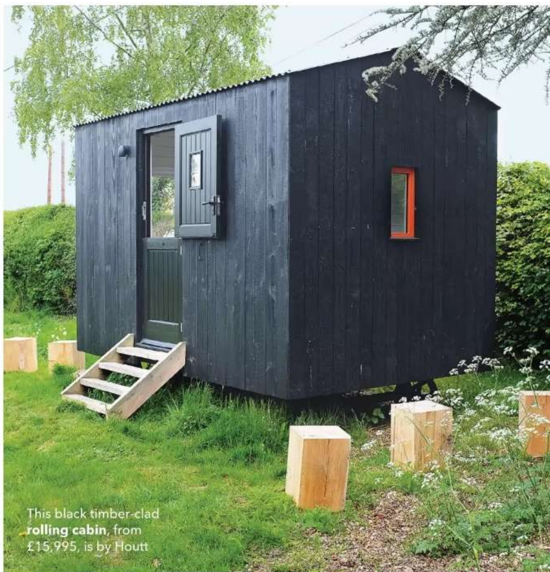
This black timber-clad rolling cabin, from £15,995, is by Houtt

Think about a modern take on the traditional shepherd's hut, but remember that any new structure in the garden needs to adhere to building regulations. Under permitted development, outbuildings must be single storey, with a maximum eaves height of 2.5m if within two metres of a boundary. Visit Planning Portal ( planningportal.co.uk ) for more information. Also, protected land, such as an Area of Outstanding Natural Beauty, is subject to stricter limitations. Check with your local planning authority before proceeding.