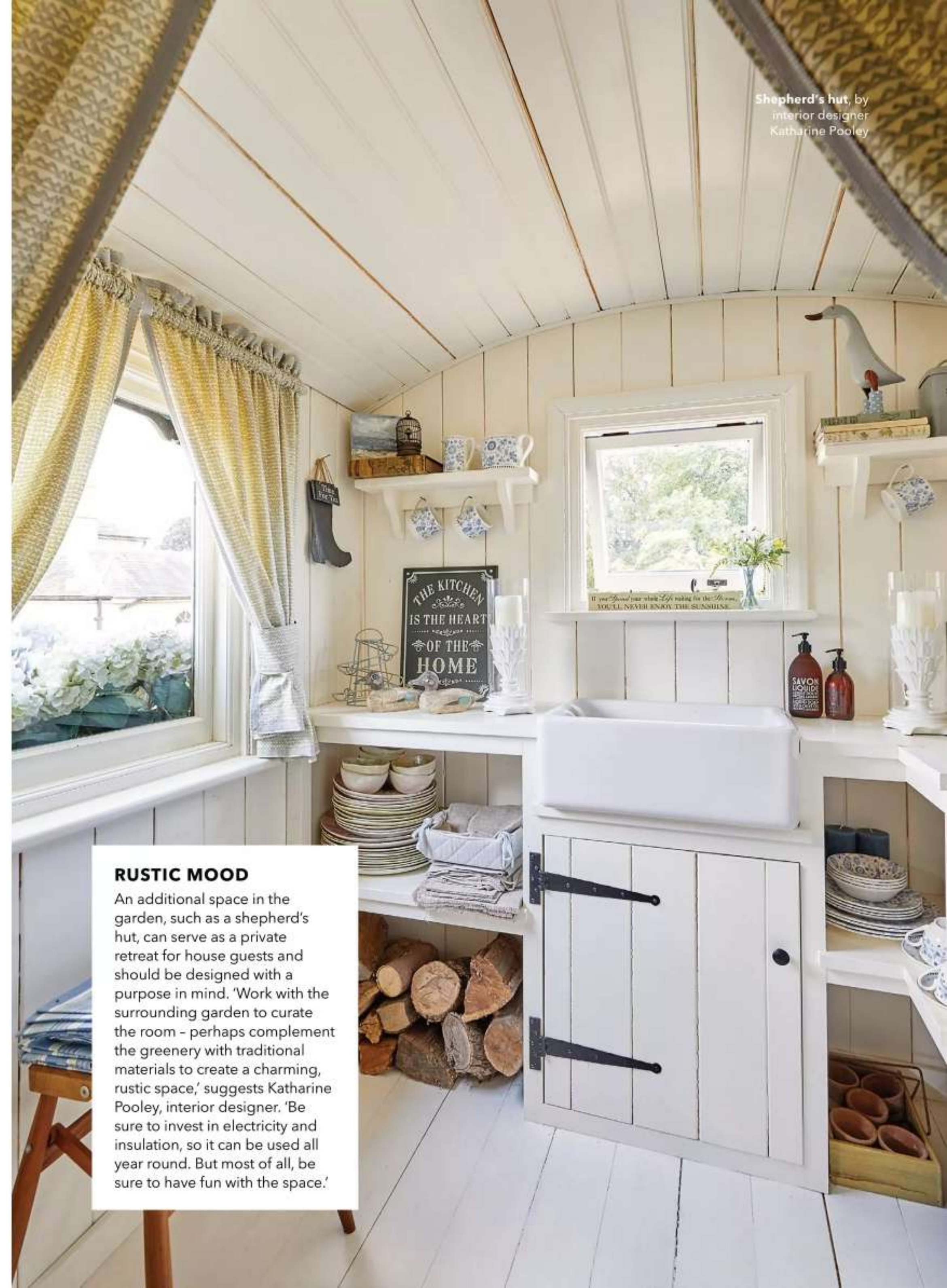
Shepherd's hut, by interior designer Katharine Pooley

By choosing bifold doors for a garden room you can help open up the space and create a strong connection to the garden. The doors allow for more light to flood in and ensure a sense of space as they can be folded neatly out of the way. Most bifold door frames come in a powder-coated aluminium, but you can also source them in a choice of RAL colours. This can be beneficial if you want to blend the garden room into its surroundings, or if you would prefer to match the exterior with the main house.