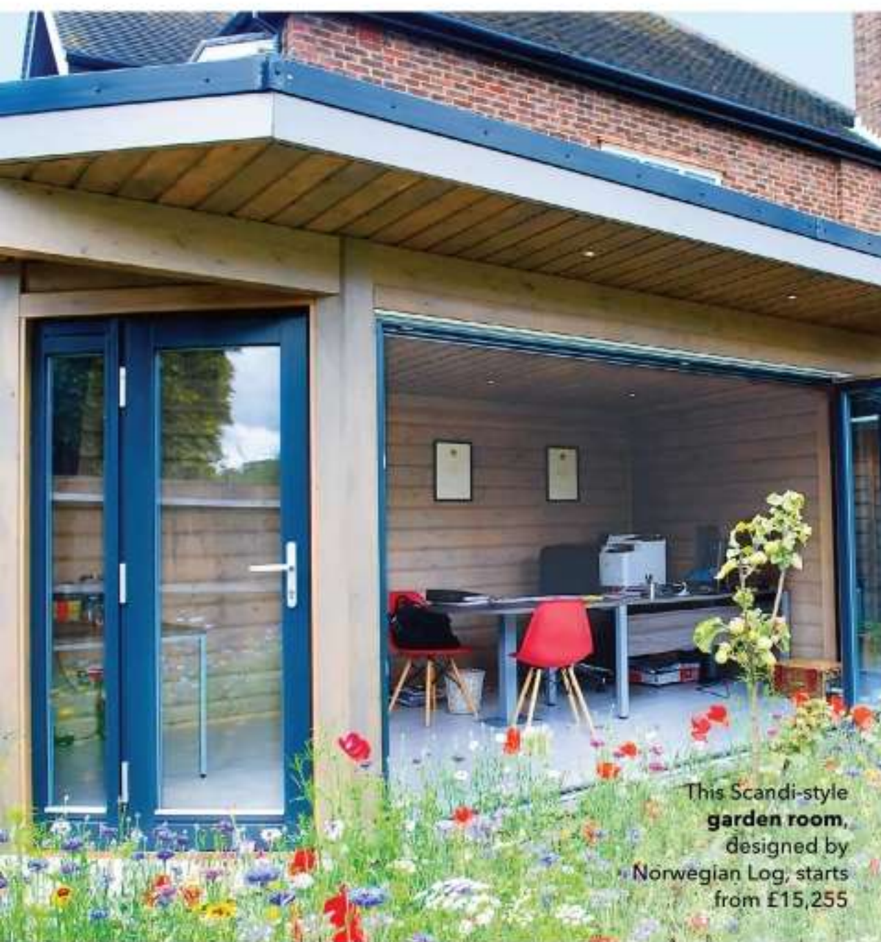
This Scandi-style garden room, designed by Norwegian Log, starts from £15,255