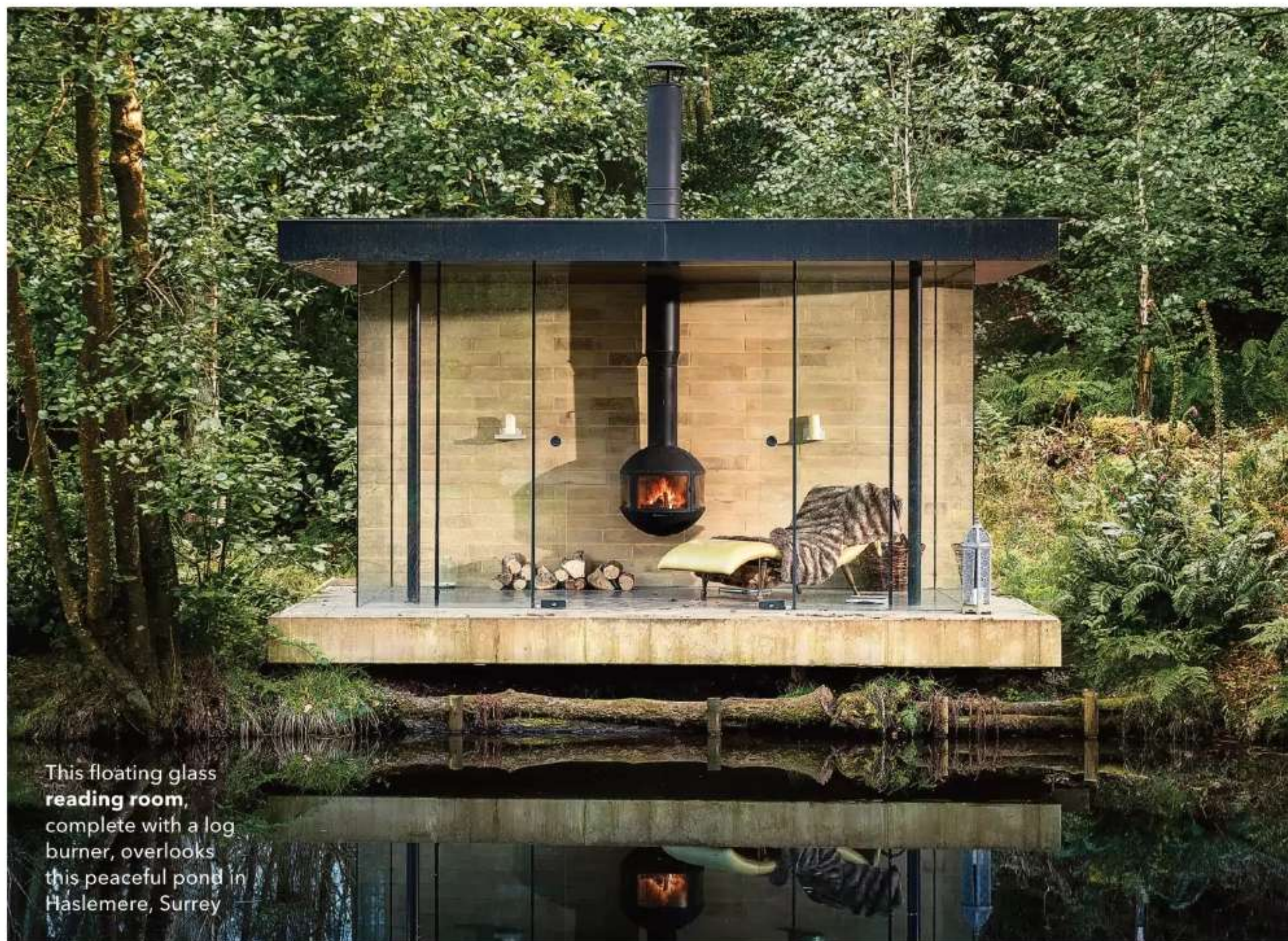
This floating glass reading room, complete with a log burner, overlooks this peaceful pond in Haslemere, Surrey