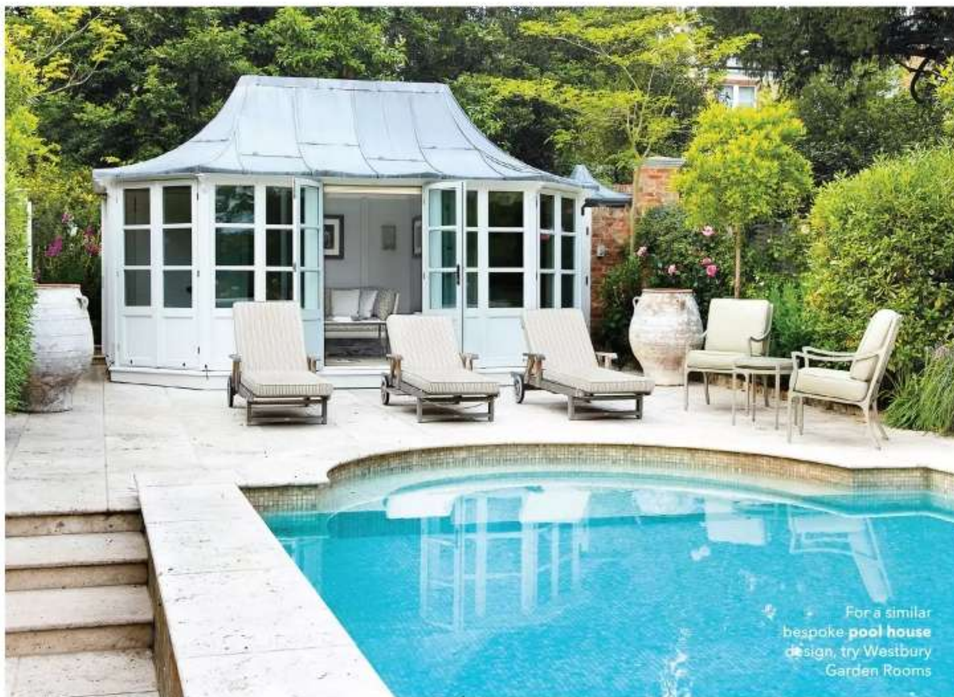
For a similar bespoke pool house design, try Westbury Garden Rooms