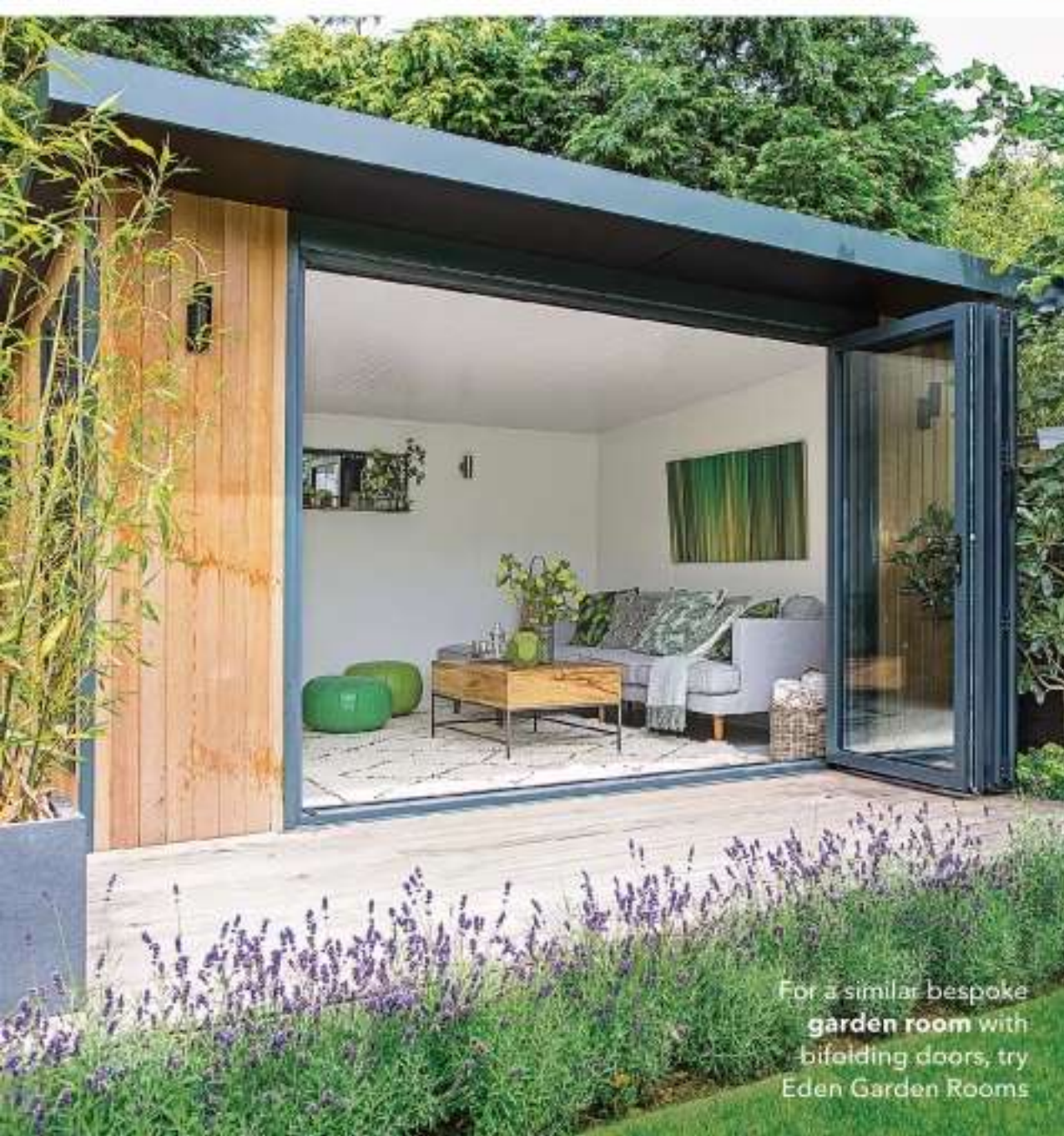
For a similar bespoke garden room with bifold doors, try Eden Garden Rooms