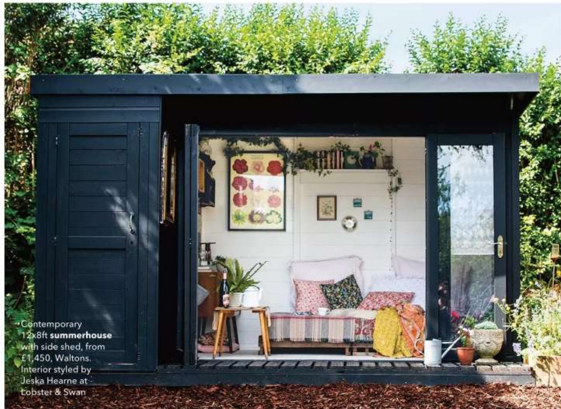
• Contemporary 12x8ft summerhouse with side shed, from £1,450, Waltons. Interior styled by Jeska Hearne at Lobster & Swan