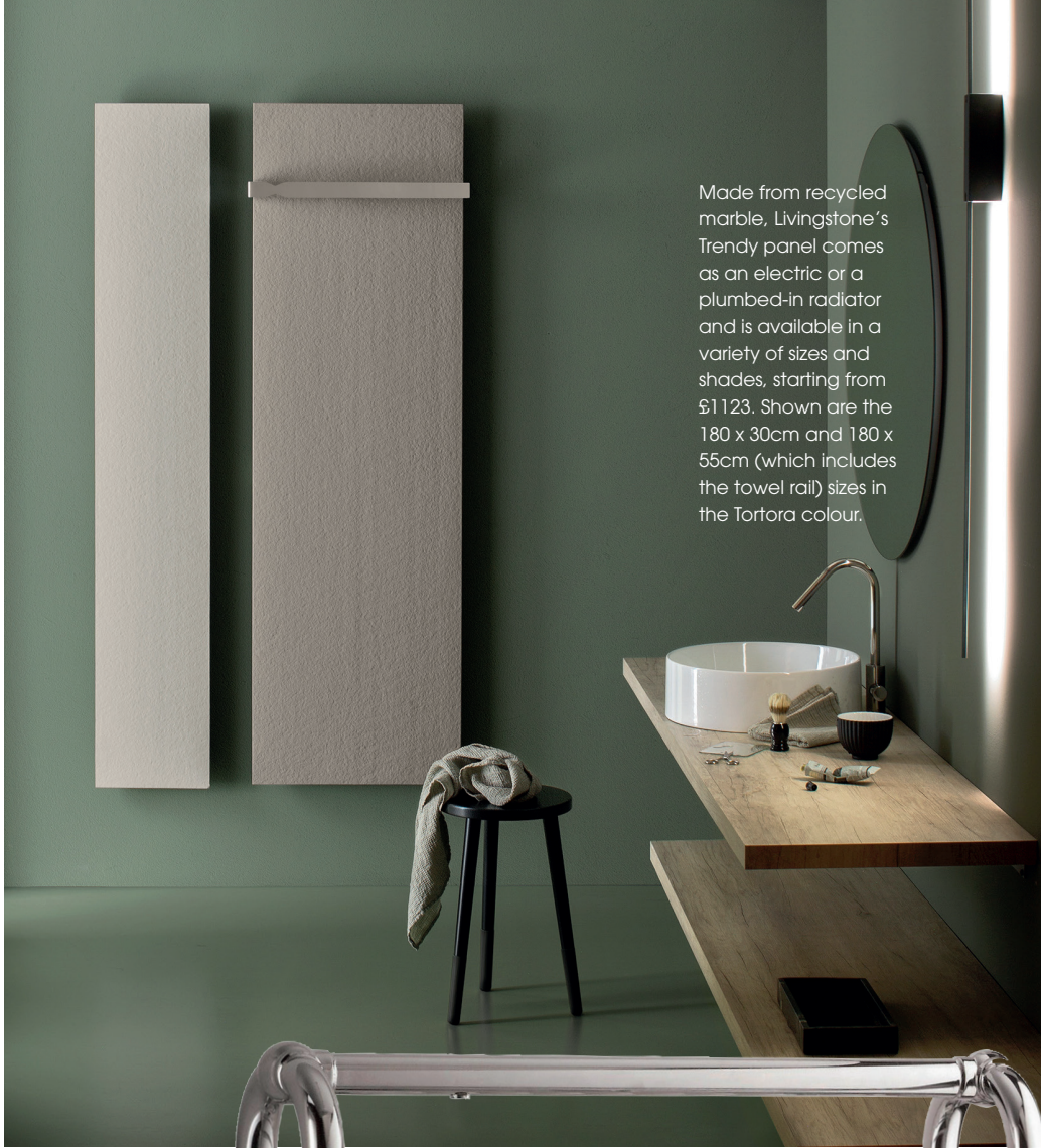
Made from recycled marble, Livingstone's Trendy panel comes as an electric or a plumbed-in radiator and is available in a variety of sizes and shades, starting from £1123. Shown are the 180 x 30cm and 180 x 55cm (which includes the towel rail) sizes in the Tortora colour.