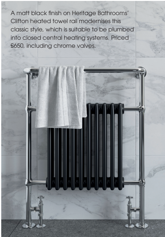
A matt black finish on Heritage Bathrooms' Clifton heated towel rail modernises this classic style, which is suitable to be plumbed into closed central heating systems. Priced £650, including chrome valves.