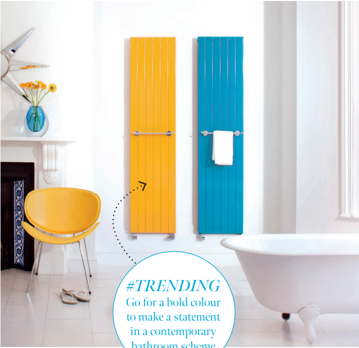
#TRENDING Go for a bold colour to make a statement in a contemporary bathroom scheme