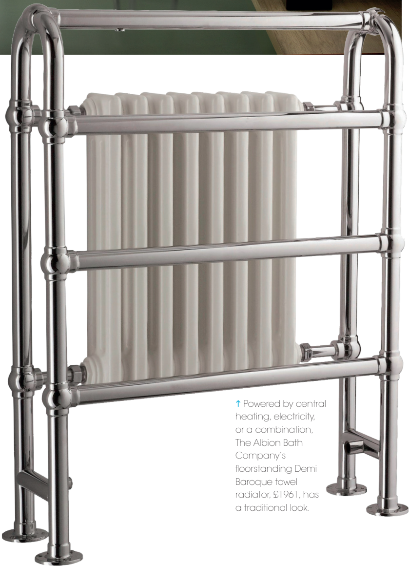
↑ Powered by central heating, electricity, or a combination, The Albion Bath Company's floorstanding Demi Baroque towel radiator, £1961, has a traditional look.