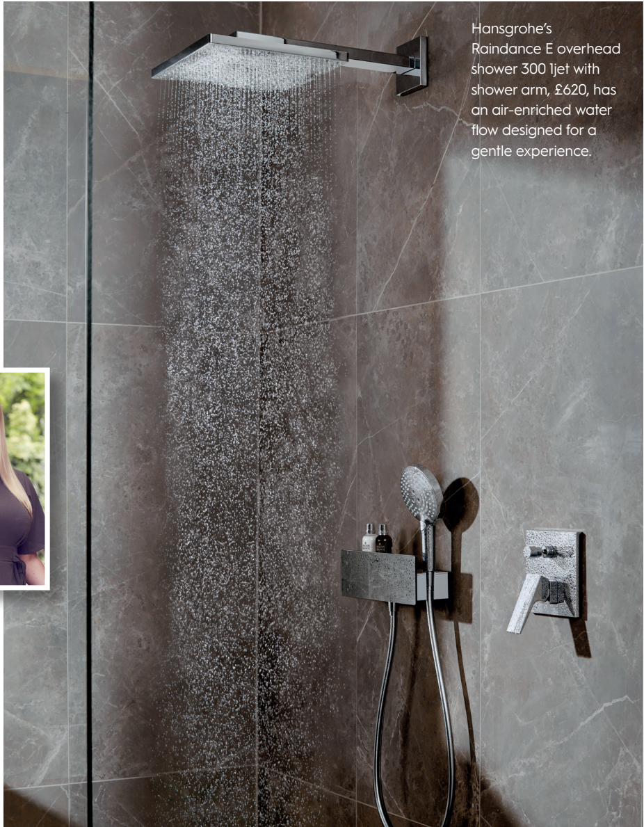
Hansgrohe's Raindance E overhead shower 300 ljet with shower arm, £620, has an air-enriched water flow designed for a gentle experience.