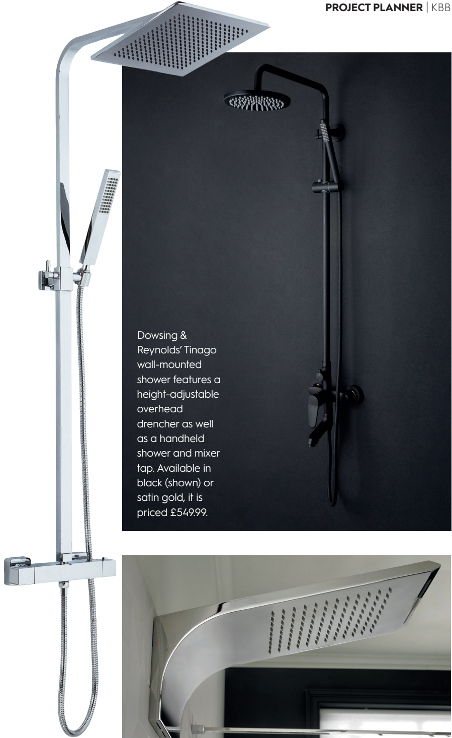
Dowsing & Reynolds' Tinago wall-mounted shower features a height-adjustable overhead drencher as well as a handheld shower and mixer tap. Available in black (shown) or satin gold, it is priced £54999.