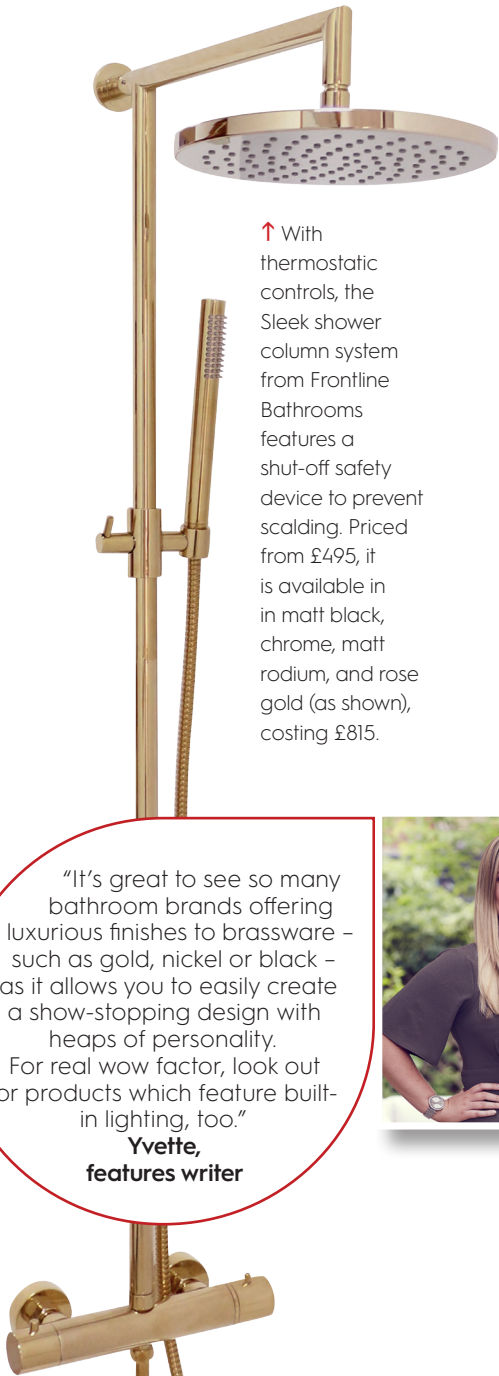
↑ With thermostatic controls, the Sleek shower column system from Frontline Bathrooms features a shut-off safety device to prevent scalding. Priced from £495, it is available in in matt black, chrome, matt rodium, and rose gold (as shown), costing £815.