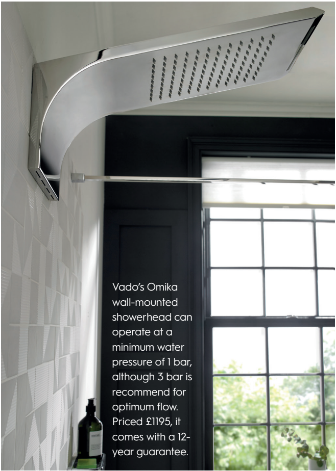
Vado's Omika wall-mounted showerhead can operate at a minimum water pressure of 1 bar, although 3 bar is recommend for optimum flow. Priced £1195, it comes with a 12-year guarantee.