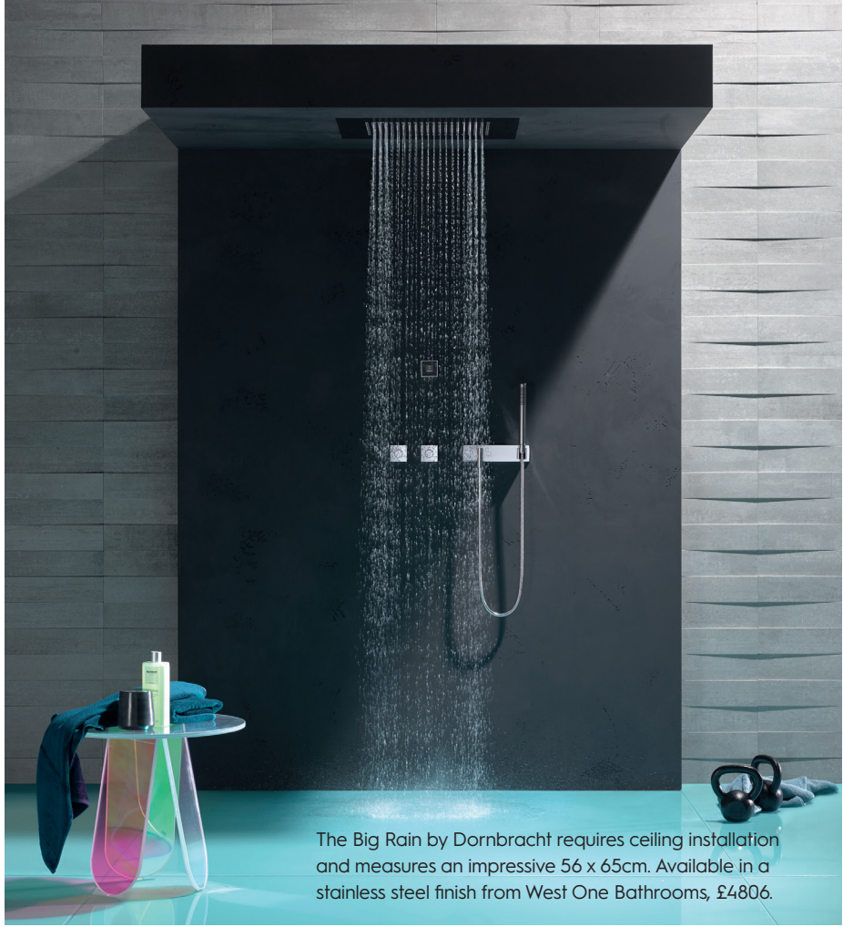
The Big Rain by Dornbracht requires ceiling installation and measures an impressive 56 x 65cm. Available in a stainless steel finish from West One Bathrooms, £4806.