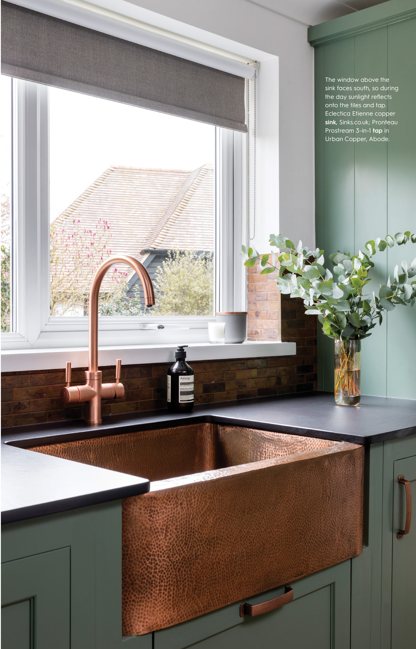
The window above the sink faces south, so during the day sunlight reflects onto the tiles and tap. Eclectica Etienne copper sink, Sinks.co.uk; Pronteau Prostream 3-in-1 tap in Urban Copper, Abode.