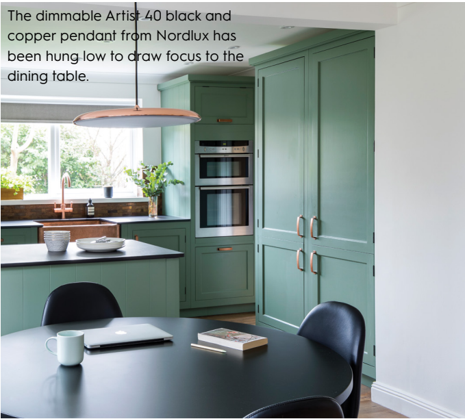
The dimmable Artist 40 black and copper pendant from Nordlux has been hung low to draw focus to the dining table.

It’s used constantly. We’re not believers in eating in front of the television, so we use the kitchen-diner at least twice a day, every day. We can now spend more quality time together as a family, and Oliver enjoys helping out with the cooking. We also feel more able to entertain, whether it’s informal gatherings or intimate dinner parties. It’s such a nice, comfortable space to spend time in, and each time I walk into it there’s something different that catches my eye.” ►