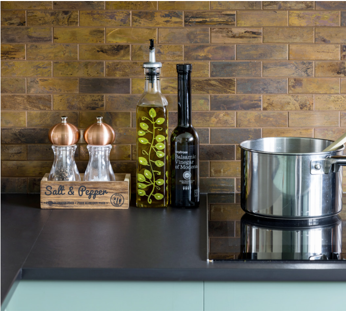
↑ The Miya Art mosaic tiles, Aliexpress, are made with pure copper, a material that naturally has anti-bacterial properties.