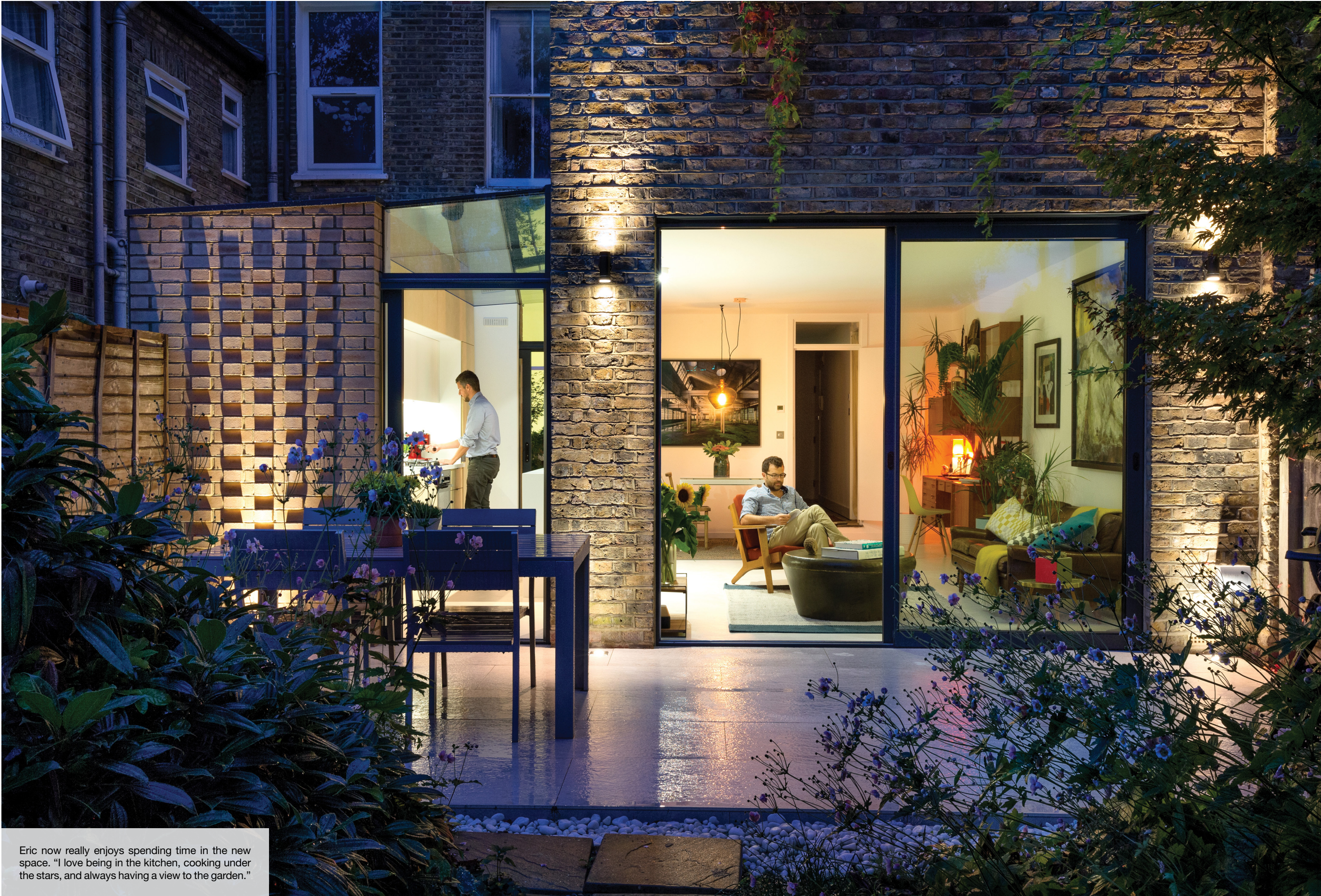
Eric now really enjoys spending time in the new space. “I love being in the kitchen, cooking under the stars, and always having a view to the garden.”