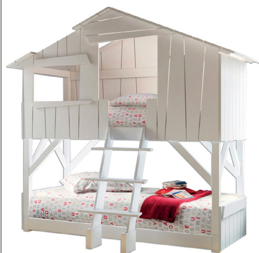
Kids Treehouse bunk bed, £1700, Babatude Boutique.