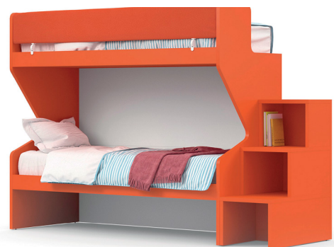
Nidi children's loft bed, from £2250, Nubie.