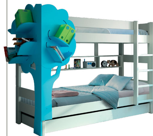
Dominique bunk bed with tree bookcase, £1990, Cuckooland.