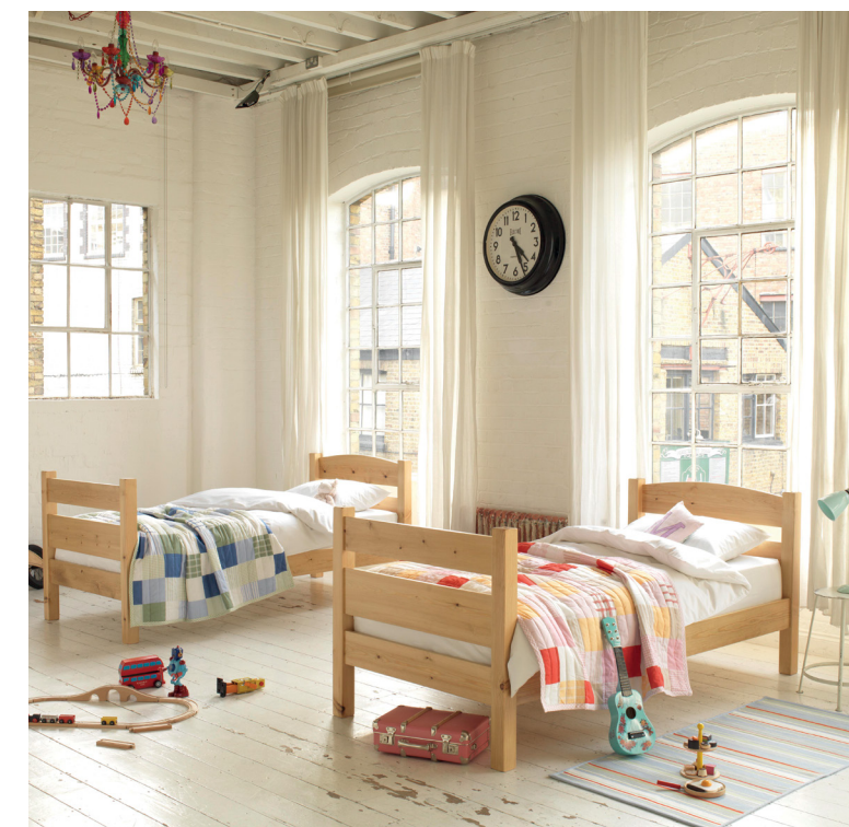
Above: This set of beds from Warren Evans works two ways – side by side or as bunk beds, with a safety rail included. Made from oak with a satin finish, it is priced £598.

I also advise buying a mattress with a guarantee – it gives you assurance that the retailer is backing the components – and try to purchase from an established bedroom brand. As a general rule of thumb, it's probably safe to assume that the longer a genuine guarantee is, the better the mattress is in terms of the quality of the fillers, springs and foam.”