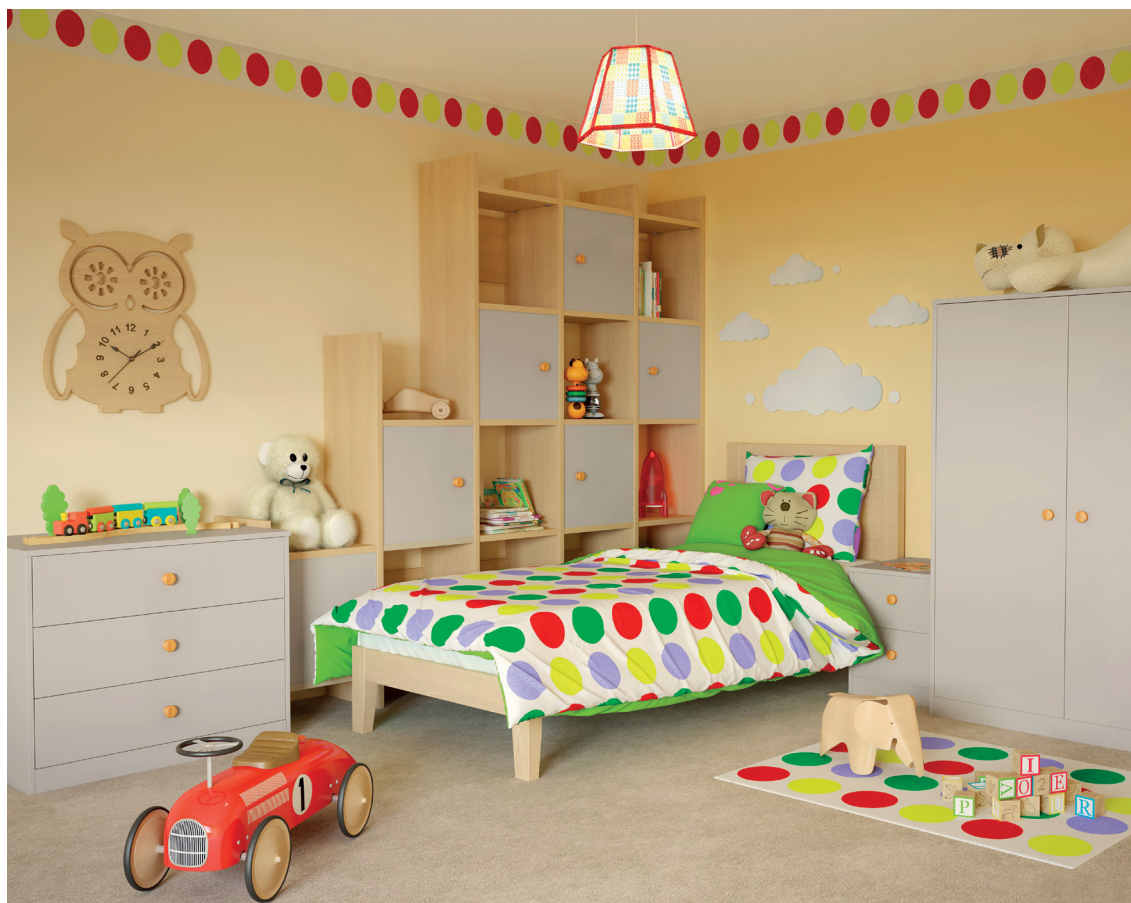
Right: Crown Imperial offers a choice of two low-level wardrobe heights and an array of different configurations you can select to suit the space – including tiered shelving, chests of drawers, wardrobes, and bedside tables. Prices start from £500.