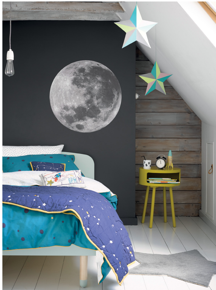
Left: Christy's Junior Galaxy bedding is available in three sizes – cot, single and double – with prices starting from £40. Also shown are the Christy Cosmo cushion, £25, and matching throw, £110.