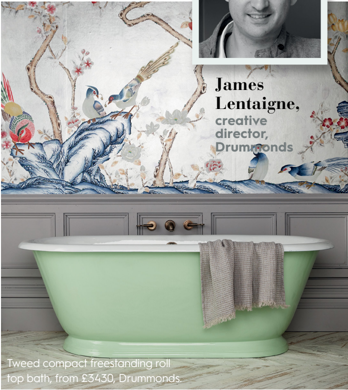
Tweed compact freestanding roll top bath, from £3430, Drummonds.