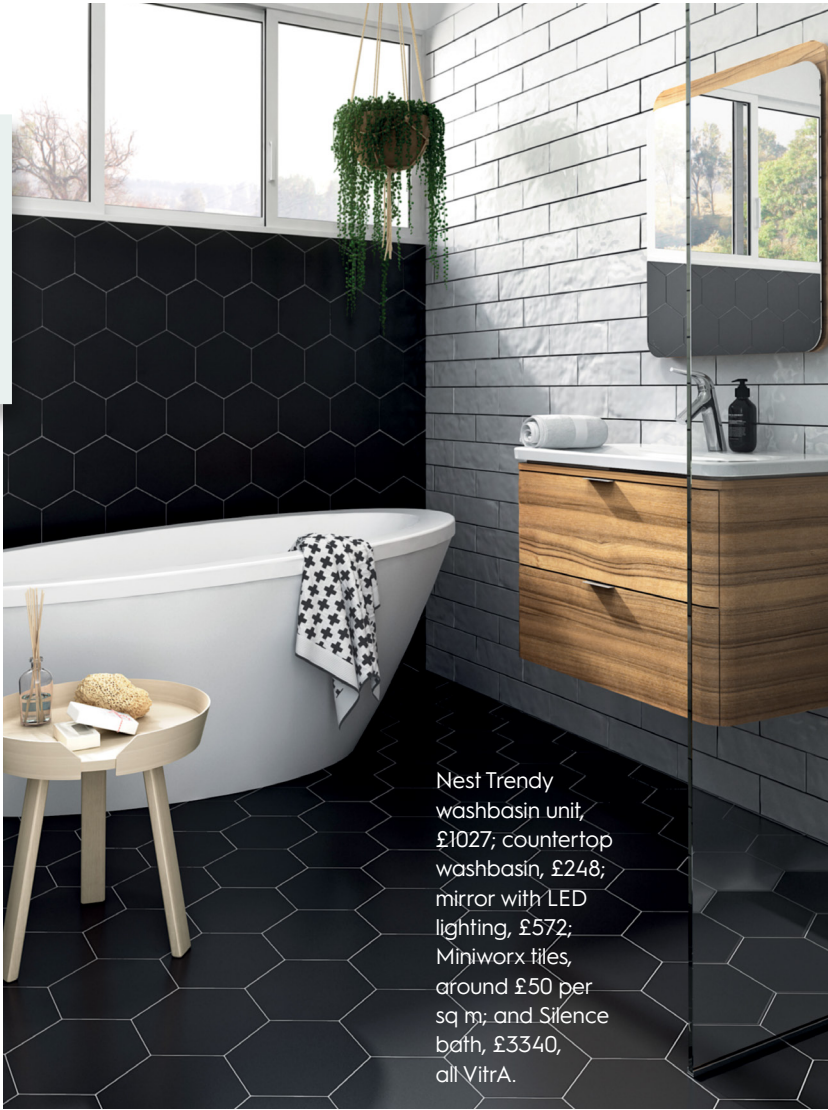
Nest Trendy washbasin unit, £1027; countertop washbasin, £248; mirror with LED lighting, £572; Miniworx tiles, around £50 per sq m; and Silence bath, £3340, all Vitra.