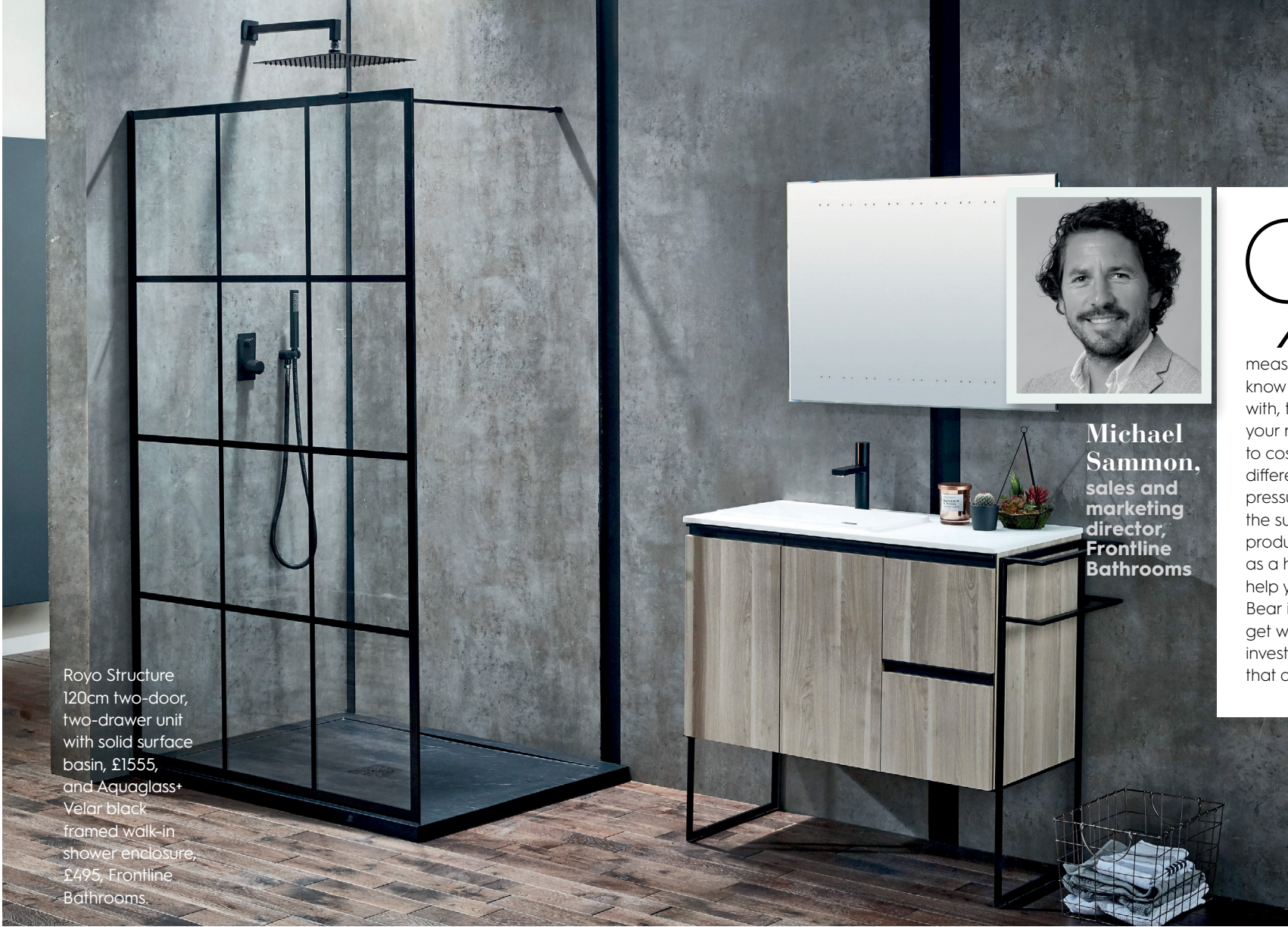
Royo Structure 120cm two-door, two-drawer unit with solid surface basin, £1555, and Aquaglass+ Velar black framed walk-in shower enclosure, £495, Frontline Bathrooms.

8 Indulge in wellness “For a spa-like experience on a smaller budget, showering products that offer multiple spray patterns – from an intense jet to a relaxing massage spray – are available. This adds a simple but opulent aspect to your showering experience, giving you the chance to tailor the water flow to suit your mood. For bigger budgets, showers are available with music, steam, and lighting options to create a personal spa in the comfort of your own home.”