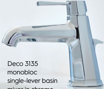
Deco 3135 monobloc single-lever basin mixer in chrome, from £527.16, Perrin & Rowe.