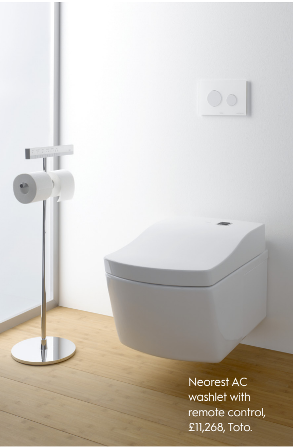
Neorest AC washlet with remote control, £11,268, Toto.

"Buying quality sanitaryware that stands the test of time is a must. Although a large spend, shower toilets are growing in popularity thanks to their additional benefits. For example, the Neorest washlet features an automatic open-close lid and remote-control wash settings, as well as self-cleaning and deodorisation. There is also a warm air dryer to reduce paper consumption and an automatic flush, which detects the need for a 3- or 6-litre flush and helps reduce your water consumption."