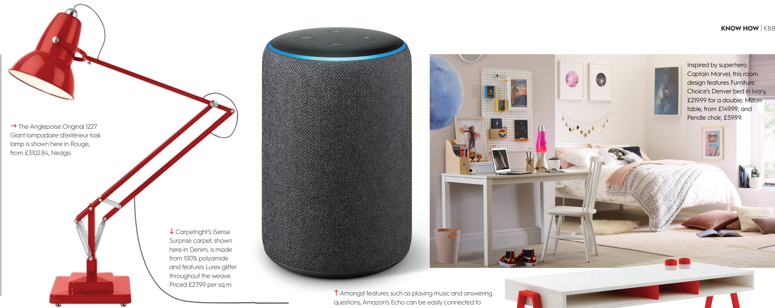
→ The Anglepoise Original 1227 Giant lampadaire d'extérieur task lamp is shown here in Rouge, from £3102.84, Nedgis.

Whether they need to have their head down revising or want to have classmates over after school, your teenager's bedroom should be a comfortable space with a practical set-up. At this age, an area for homework is important – but try not to let it dominate the room, as it is still a place of rest. A pin board, task lamp, and comfortable chair alongside a desk should suffice. A day bed works well in a teen's bedroom as a relaxing spot to hang out with friends that can easily transition into a sleep area at night. Ensure there is plenty of storage for clothing, as well as places where they can display posters, trophies, and memorabilia that allow them to show off their personality and make the space feel like their own. You may not want to allow a television in the bedroom, but a smart speaker is worth considering so they can enjoy listening to music. KBB