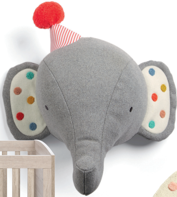
← Introduce sensory colours through accessories in your child’s room, such as this Big Top Tales Elephant wall art, £19, from Mamas & Papas.