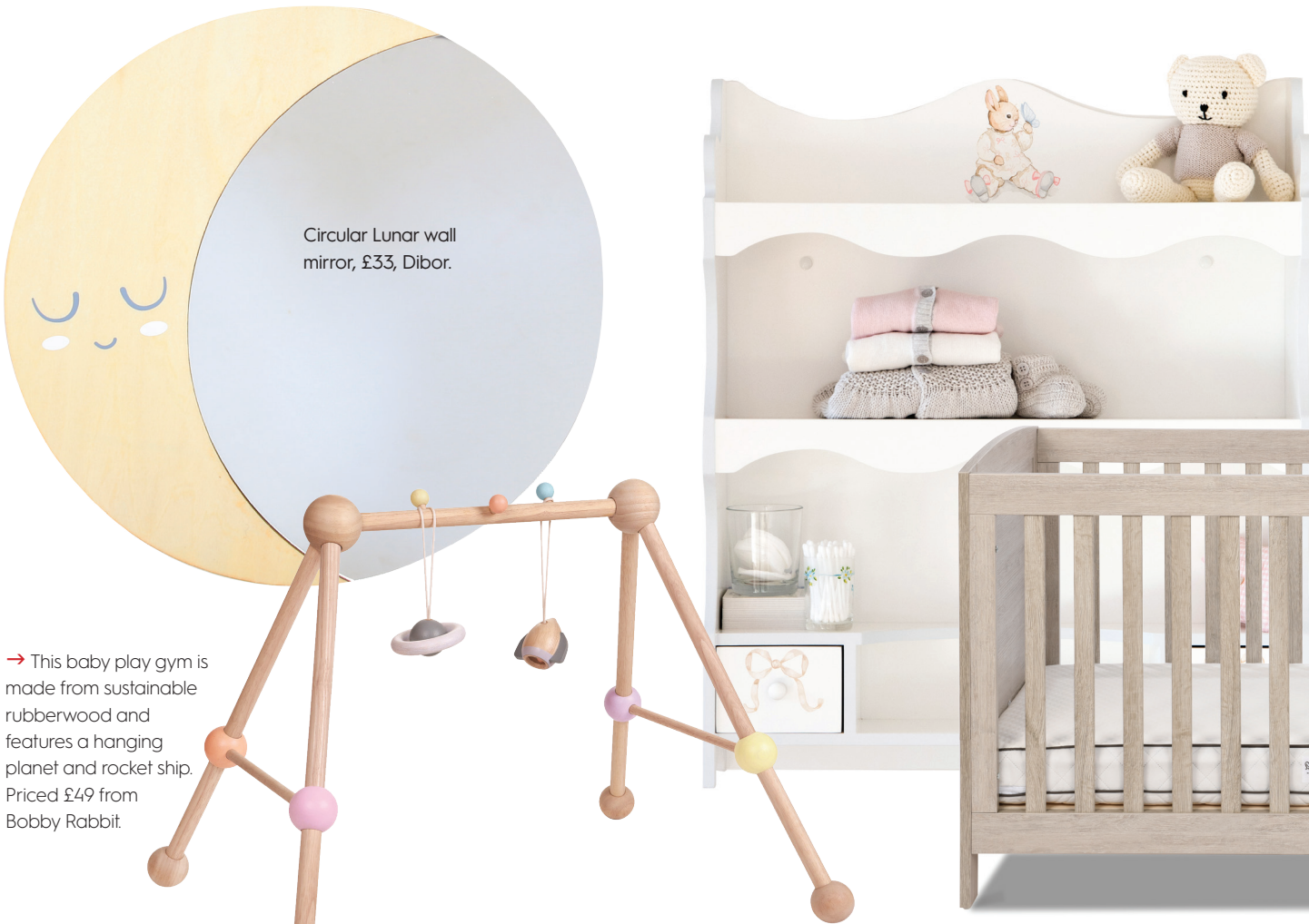
→ This baby play gym is made from sustainable rubberwood and features a hanging planet and rocket ship. Priced £49 from Bobby Rabbit.