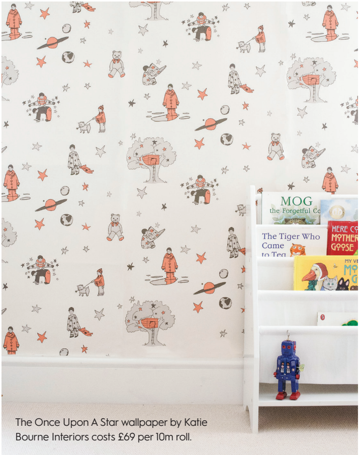
The Once Upon A Star wallpaper by Katie Bourne Interiors costs £69 per 10m roll.