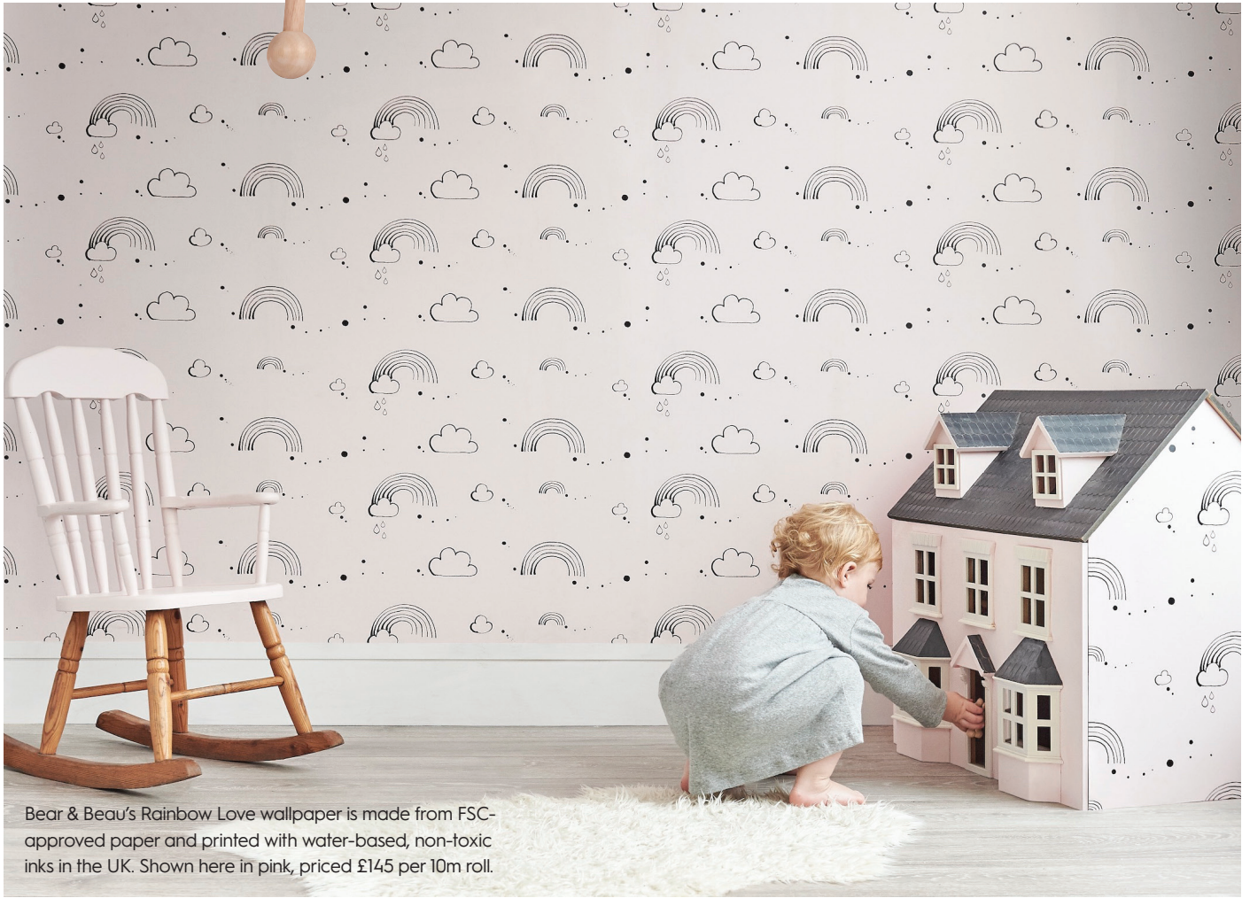
Bear & Beau’s Rainbow Love wallpaper is made from FSC-approved paper and printed with water-based, non-toxic inks in the UK. Shown here in pink, priced £145 per 10m roll.