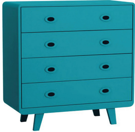
← With smooth curved edges and a handpainted finish, Laurette's Like You And Me chest of drawers is shown here in a Peacock blue. Priced £792 from Smallable.