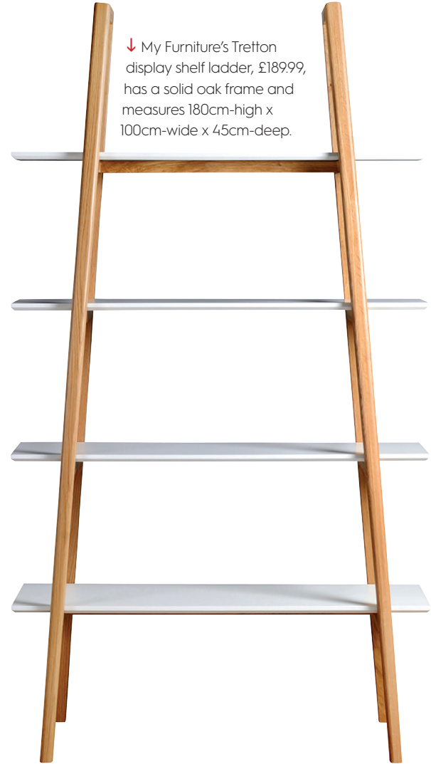
↓ My Furniture's Tretton display shelf ladder, £189.99, has a solid oak frame and measures 180cm-high x 100cm-wide x 45cm-deep.