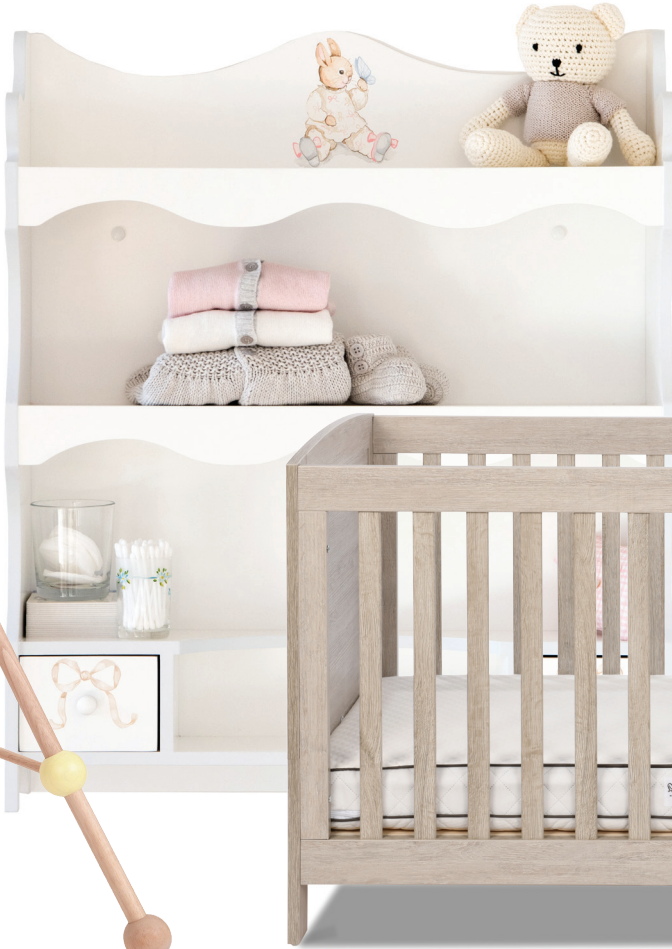
← These compact hanging shelves by Dragons of Walton Street, priced from £650, measure 71cm-high x 60cm-wide x 15 cm-deep and include drawers ideal for small mementos.