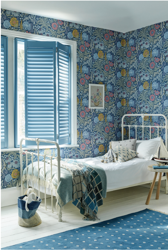
→ Full-height premium teak shutters in Dulux trade colour paint Luna Landscape, from £159 per sq m, California Shutters. And without cords, they also don't pose a strangulation hazards for your little ones.