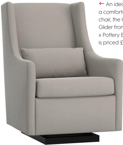
← An ideal choice as a comfortable nursing chair, the Graham Glider from West Elm x Pottery Barn Kids is priced £999.