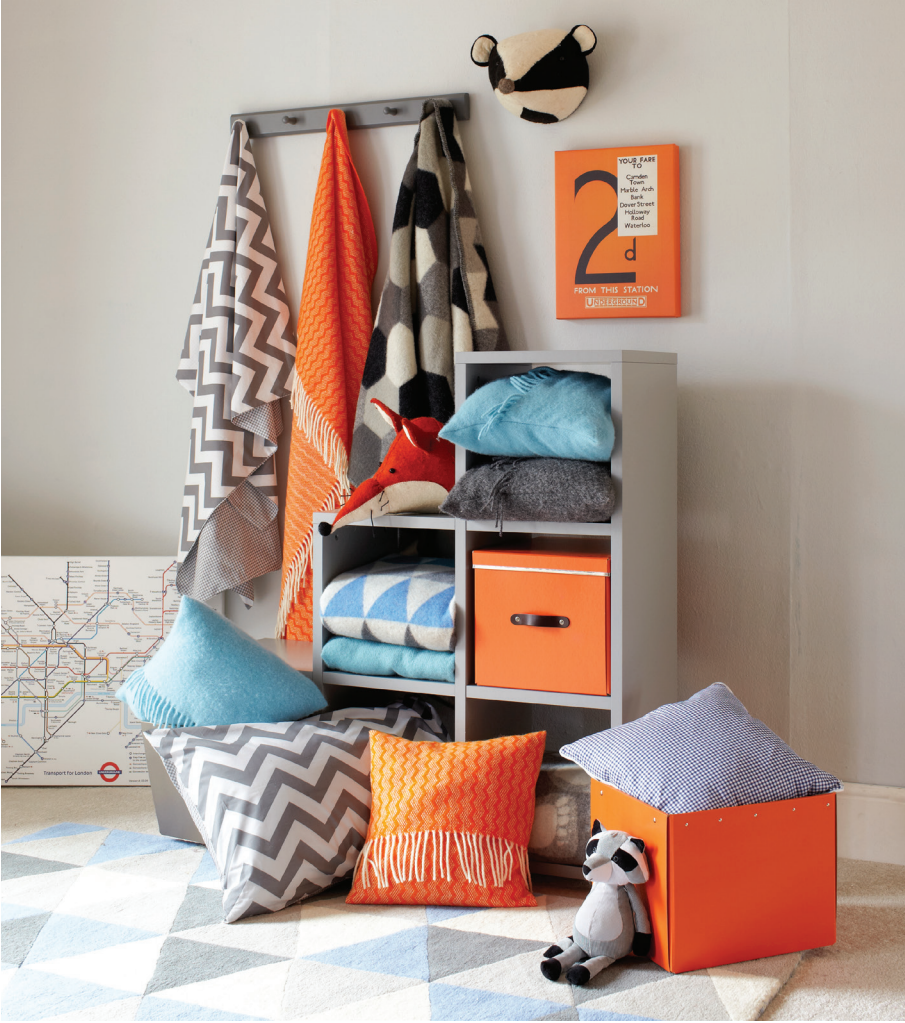
↑ Tissera stepped storage unit, from £99, Aspace.