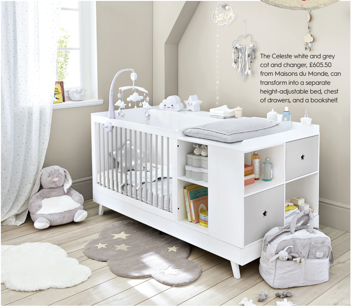
The Celeste white and grey cot and changer, £605.50 from Maisons du Monde, can transform into a separate height-adjustable bed, chest of drawers, and a bookshelf.