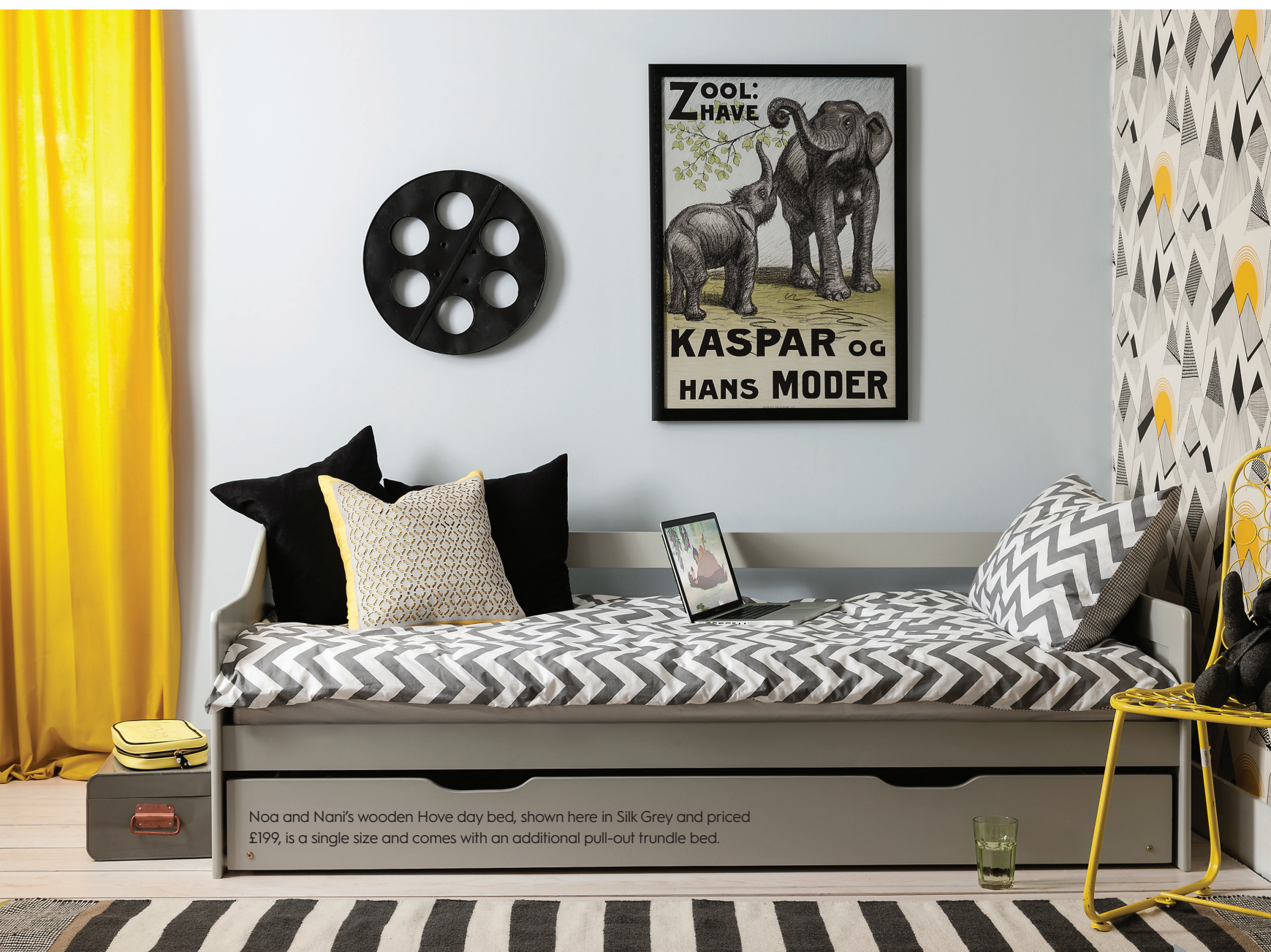
Noa and Nani's wooden Hove day bed, shown here in Silk Grey and priced £199, is a single size and comes with an additional pull-out trundle bed.