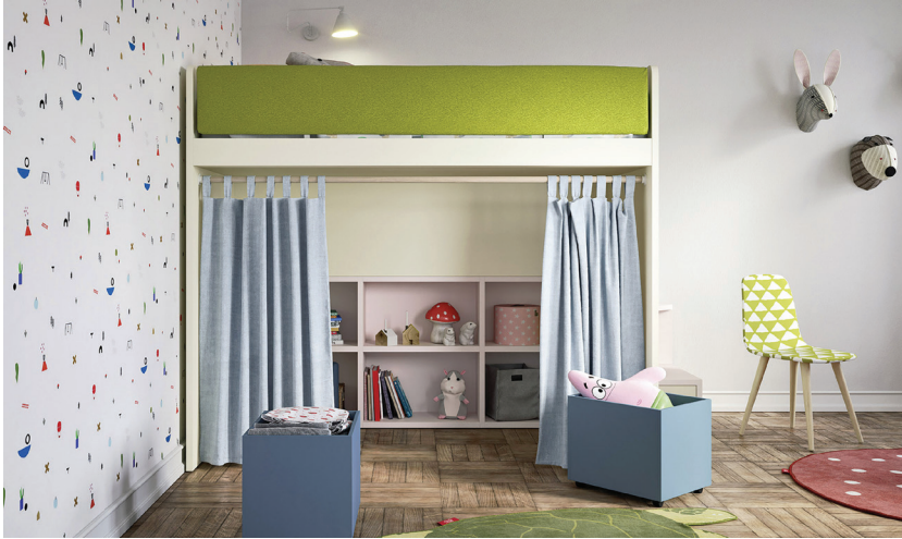
↑ The Ergo Loft bed with curtain, storage, and drawer sidesteps is available in 22 colours and natural finishes, including Blanco, as shown, £2395 from Nubie.