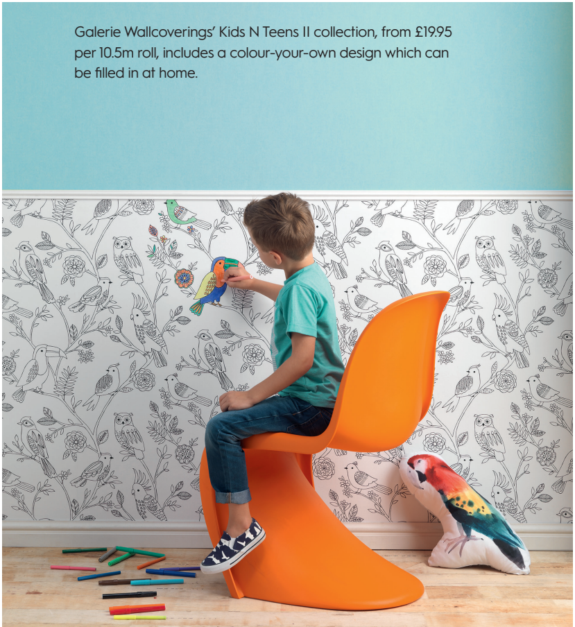
Galerie Wallcoverings' Kids N Teens II collection, from £19.95 per 10.5m roll, includes a colour-your-own design which can be filled in at home.