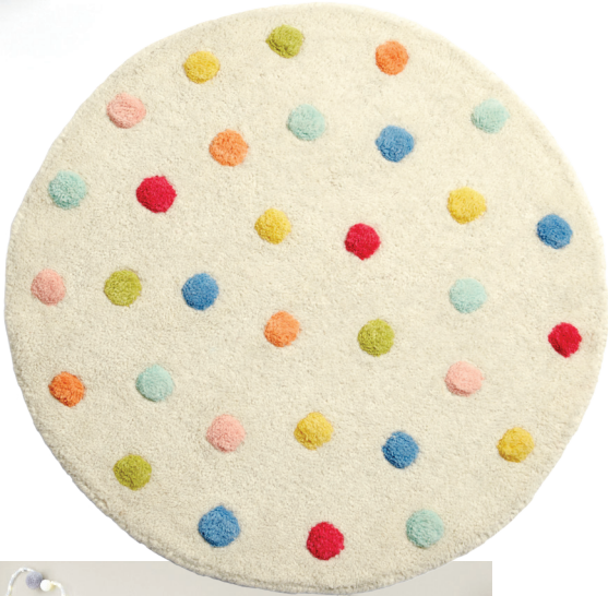
← The New England nursery set, £1149, from Silver Cross includes a cot bed with three base positions which can also transform into a toddler bed, as well as a dresser with a changing unit and a wardrobe. The shown cot alone costs £349.