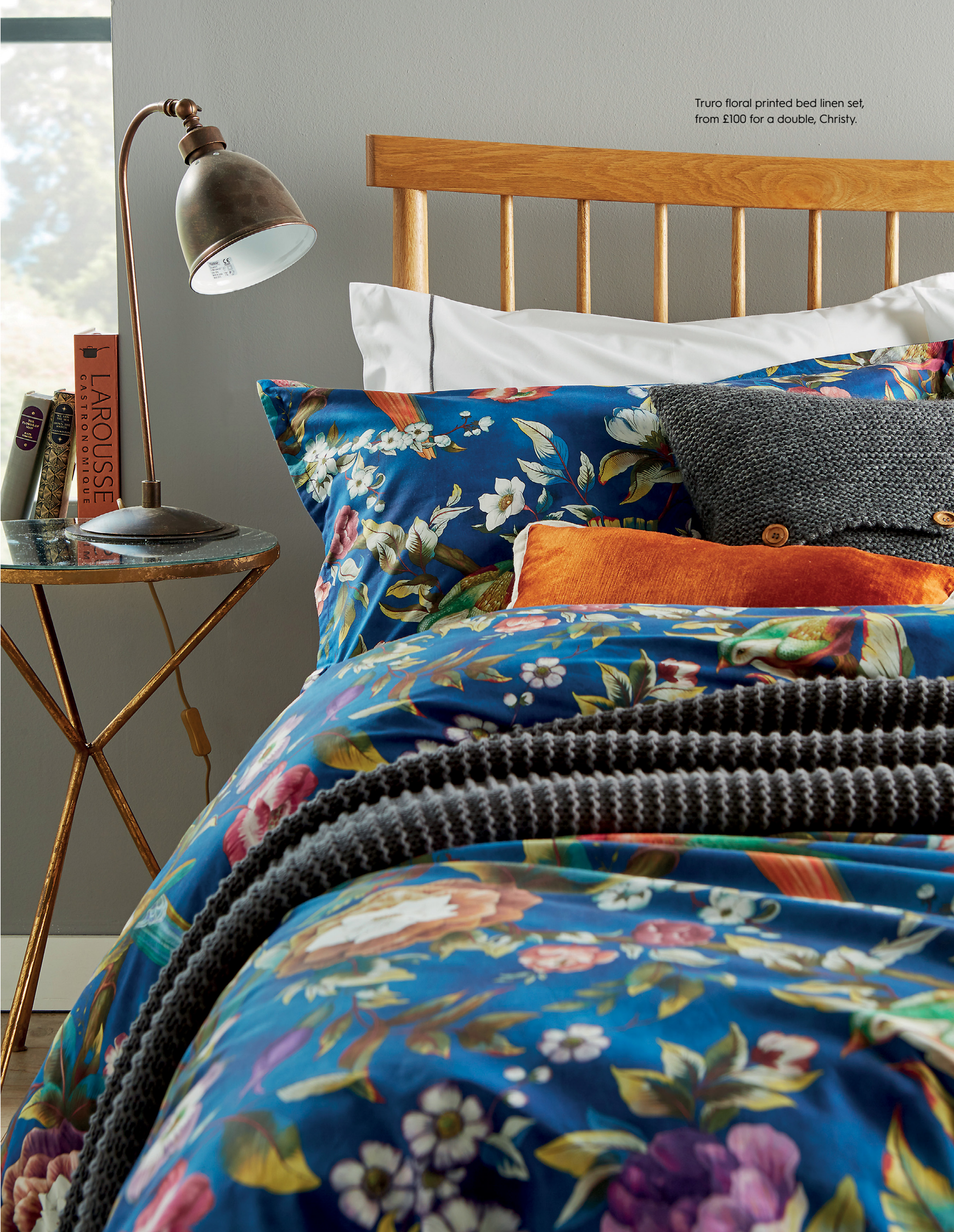
Truro floral printed bed linen set, from £100 for a double, Christy.