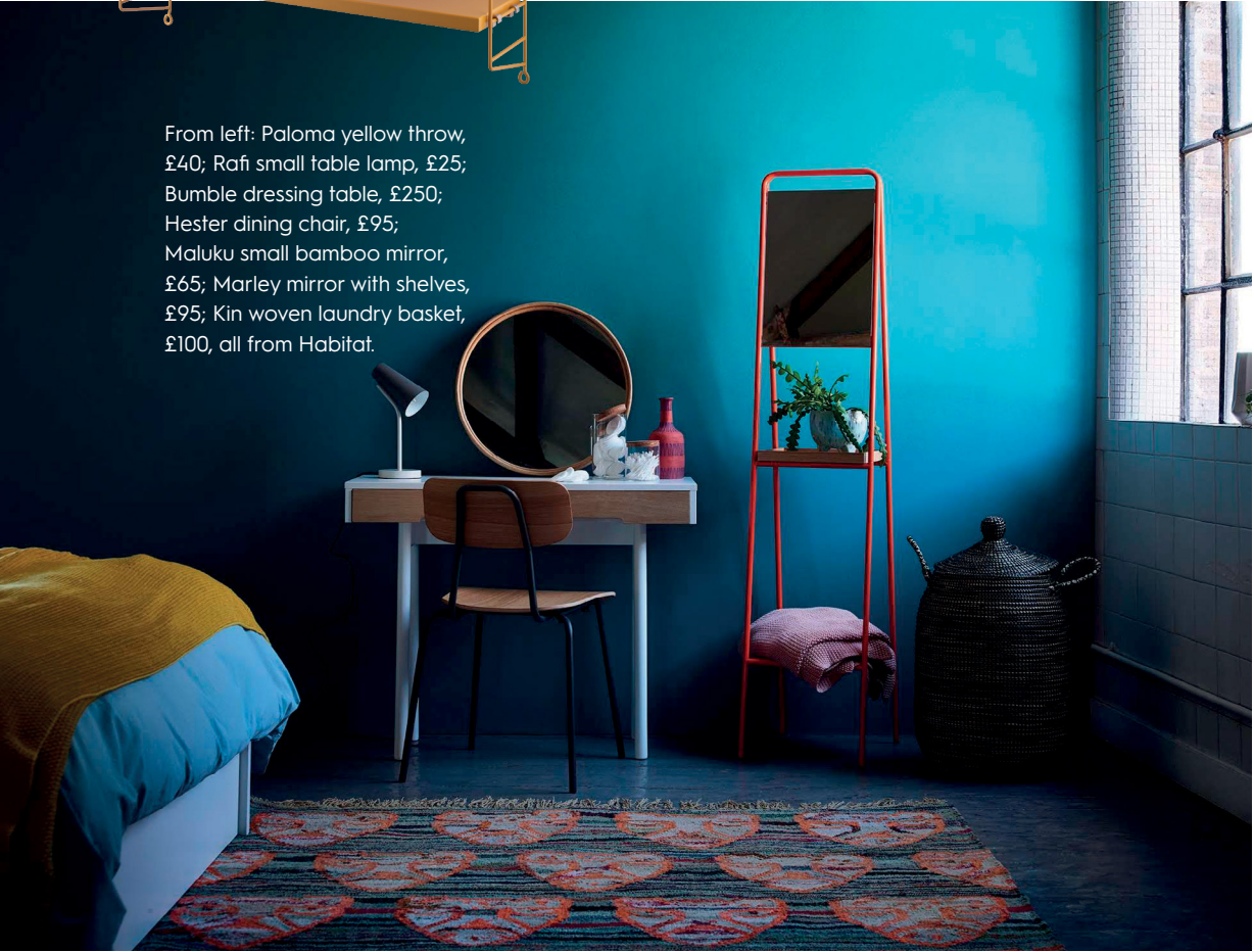
From left: Paloma yellow throw, £40; Rafi small table lamp, £25; Bumble dressing table, £250; Hester dining chair, £95; Maluku small bamboo mirror, £65; Marley mirror with shelves, £95; Kin woven laundry basket, £100, all from Habitat.

← Blackout roller blind in Cordova Peacock, from £108 including measuring and fitting, Hillarys.