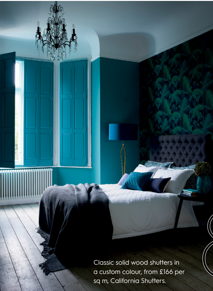
Classic solid wood shutters in a custom colour, from £166 per sq m, California Shutters.