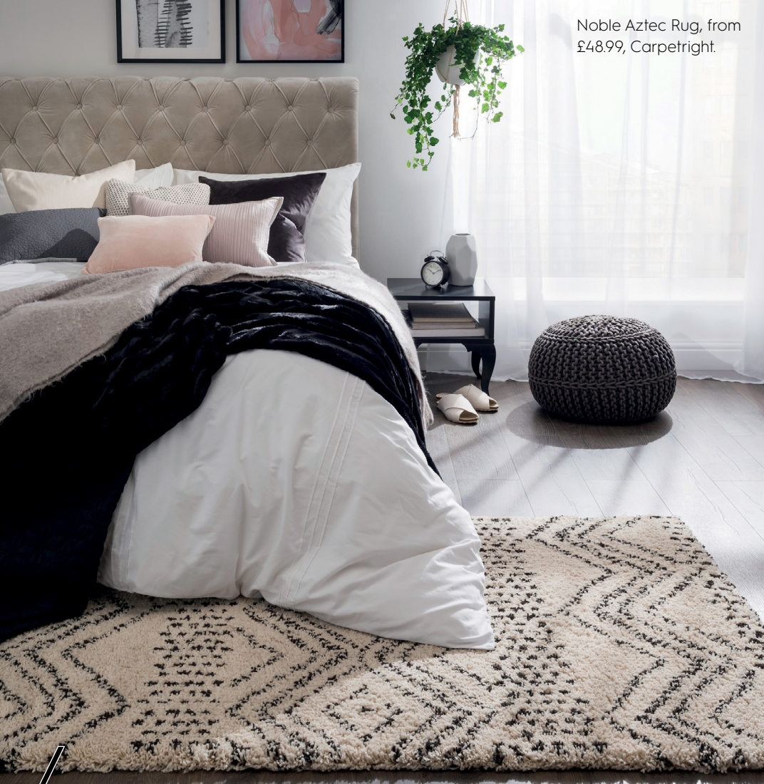
Noble Aztec Rug, from £48.99, Carpetright.

We tend to keep things neutral underfoot, often focusing on the material and its comfort level instead, but Anna Del Molino from Carpetright sees floorcoverings as another opportunity to inject personality into a bedroom. “Adding a new rug is one of the easiest ways to incorporate colour and pattern without a large investment,” she explains. “Rugs are particularly well suited to wood flooring, as they not only add another level of comfort but can also help to warm the décor by contrasting the natural look.”