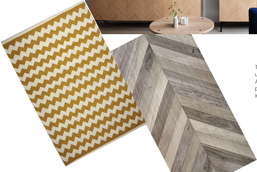
↓ Lombard handwoven rug in Golden Chevron, £229, Swoon Editions. swooneditions.com ↘ Cerused mix wood-effect chevron tiles, £49.95 per sq m, Walls and Floors. wallsandfloors.co.uk

This simple pattern adds a layer of detail wherever it is used – it doesn't have to be confined to wood flooring. A timeless look, you can tile your bathroom in a zigzag pattern, find cushions and rugs in colourful prints, or invest in furniture featuring this subtle design.