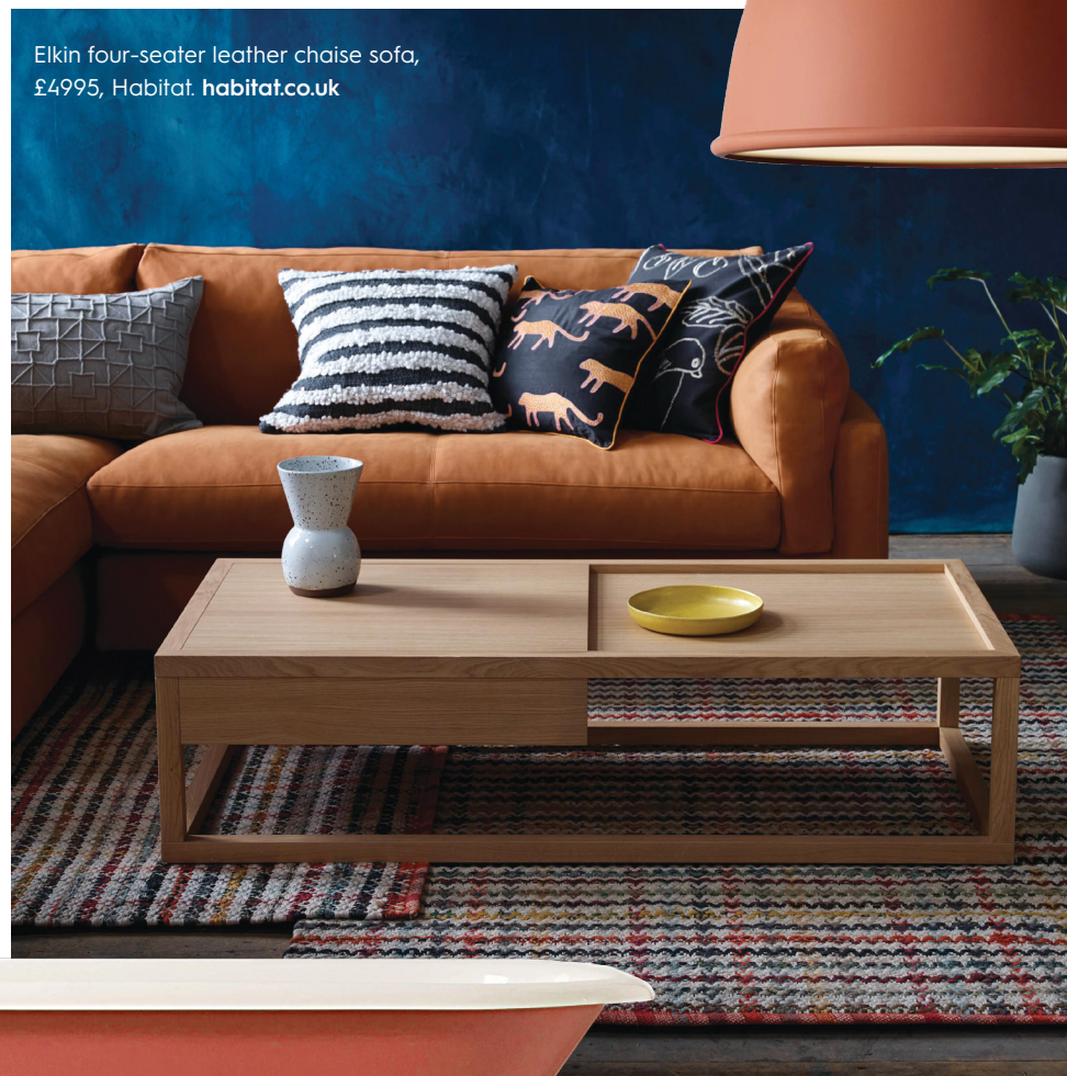
Elkin four-seater leather chaise sofa, £4995, Habitat. habitat.co.uk

Reminiscent of autumn leaves, this rich burnt-orange tone is ideal for amping up the comfort factor this time of year. The shade instantly makes a space feel warmer, working well against dark and moody backdrops. Think beyond brickwork and look out for paints as well as fabrics too.