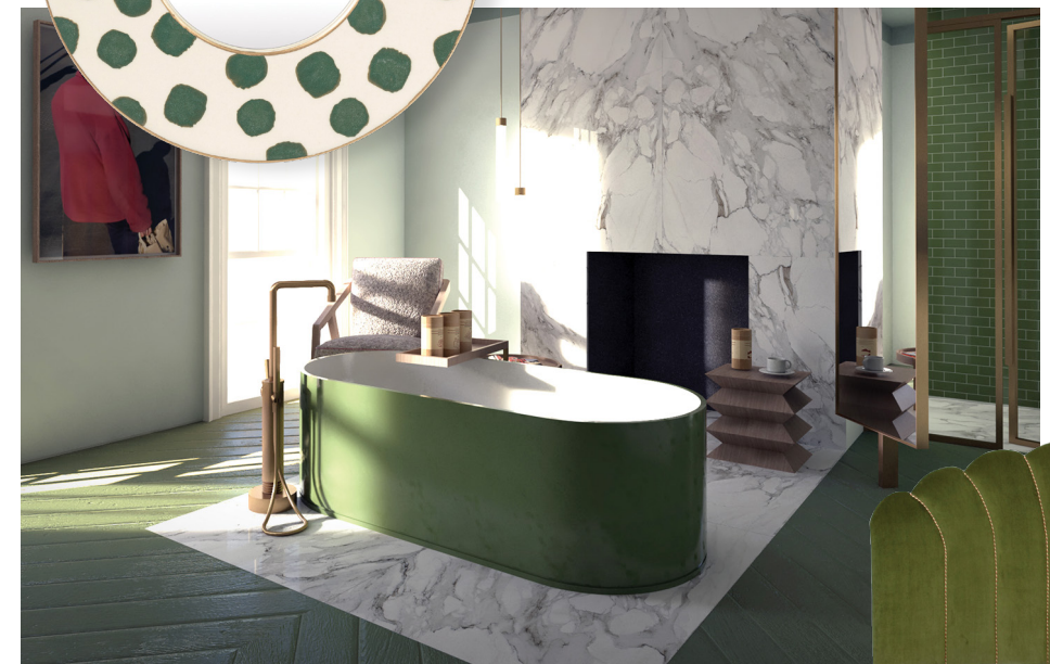
← Custom bathroom design, price on application, Boundary Space. boundaryspace.com

A staple on brunch menus, the humble avocado has become a national obsession – and when it comes to interiors, it's the fruit's botanical green tones that we can't get enough of. If the idea of the avocado bathroom returning isn't quite for you, why not try incorporating the colour elsewhere in your home instead? We love this double bed.