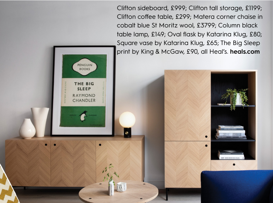
Clifton sideboard, £999; Clifton tall storage, £1199; Clifton coffee table, £299; Matera corner chaise in cobalt blue St Moritz wool, £3799; Column black table lamp, £149; Oval flask by Katarina Klug, £80; Square vase by Katarina Klug, £65; The Big Sleep print by King & McGaw, £90, all Heal's. heals.com