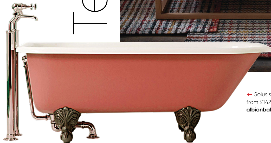
← Solus single-ended bath in Tiled Orange, from £1428, The Albion Bath Company. albionbathco.com