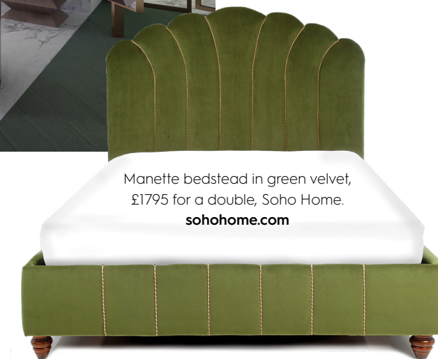
Manette bedstead in green velvet, £1795 for a double, Soho Home. sohohome.com

A staple on brunch menus, the humble avocado has become a national obsession – and when it comes to interiors, it's the fruit's botanical green tones that we can't get enough of. If the idea of the avocado bathroom returning isn't quite for you, why not try incorporating the colour elsewhere in your home instead? We love this double bed.