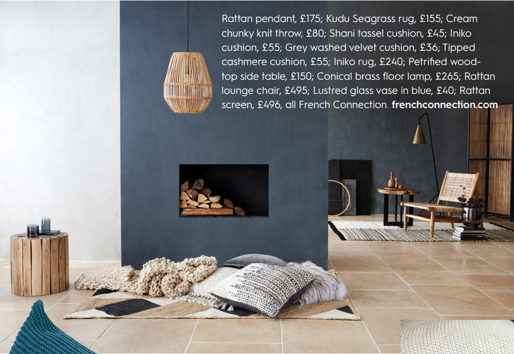
Rattan pendant, £175; Kudu Seagrass rug, £155; Cream chunky knit throw, £80; Shani tassel cushion, £45; Iniko cushion, £55; Grey washed velvet cushion, £36; Tipped cashmere cushion, £55; Iniko rug, £240; Petrified wood-top side table, £150; Conical brass floor lamp, £265; Rattan lounge chair, £495; Lustrated glass vase in blue, £40; Rattan screen, £496, all French Connection. frenchconnection.com