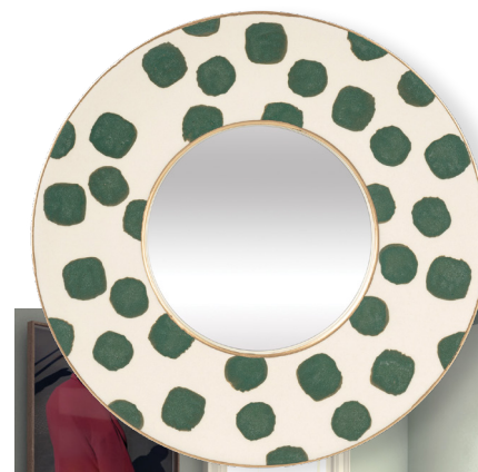
← Ceramic round wall mirror, £49.50, Oliver Bonas. oliverbonas.com