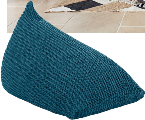
→ Ila Lambswool throws, £180, and cushion covers, £52.90 each, Shimu. shimu.co.uk ← Andra large chunky-knit bean bag in Teal, £149, Made. made.com