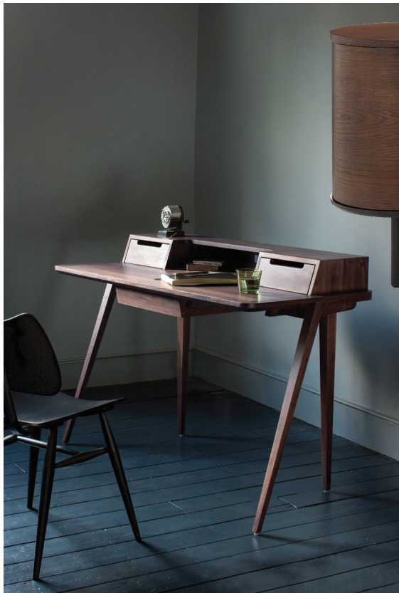
↑ Yoko sideboard in Dark Oak, £699, John Lewis. johnlewis.com ← Treviso desk in walnut, £2225, Ercol. ercol.com

Trade your ash and oak for a distinctly darker shade. Walnut furniture with a Mid-century modern design creates sleek and sophisticated scheme and looks perfect with black detailing and brass finishes – smart.