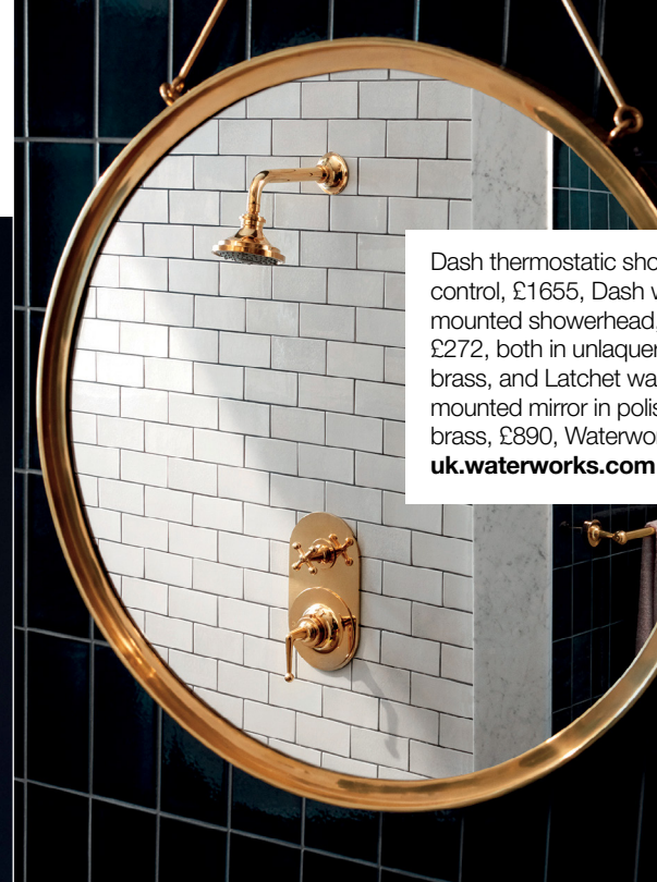
Dash thermostatic shower control, £1655, Dash wall-mounted showerhead, from £272, both in unlacquered brass, and Latchet wall-mounted mirror in polished brass, £890, Waterworks. uk.waterworks.com