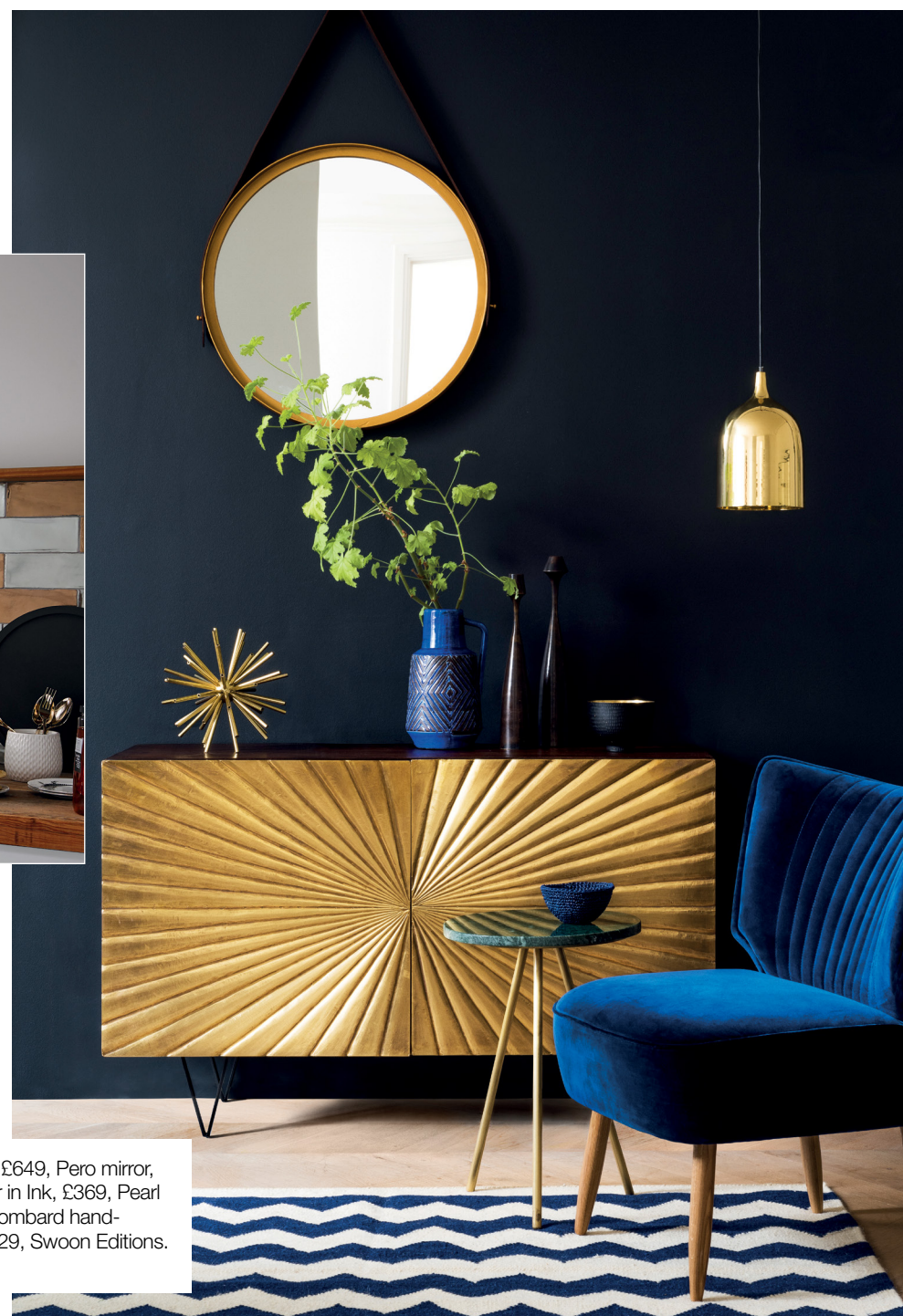
Ziggy brass sideboard, £649, Pero mirror, £179, Fitz cocktail chair in Ink, £369, Pearl side table, £149, and Lombard hand-woven chevron rug, £229, Swoon Editions. swooneditions.com