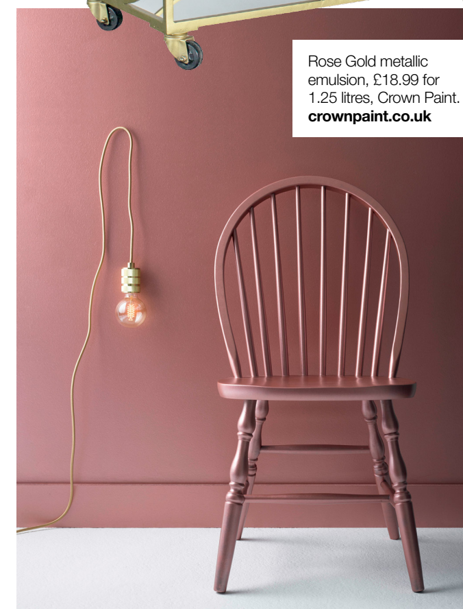
Rose Gold metallic emulsion, £18.99 for 1.25 litres, Crown Paint. crownpaint.co.uk