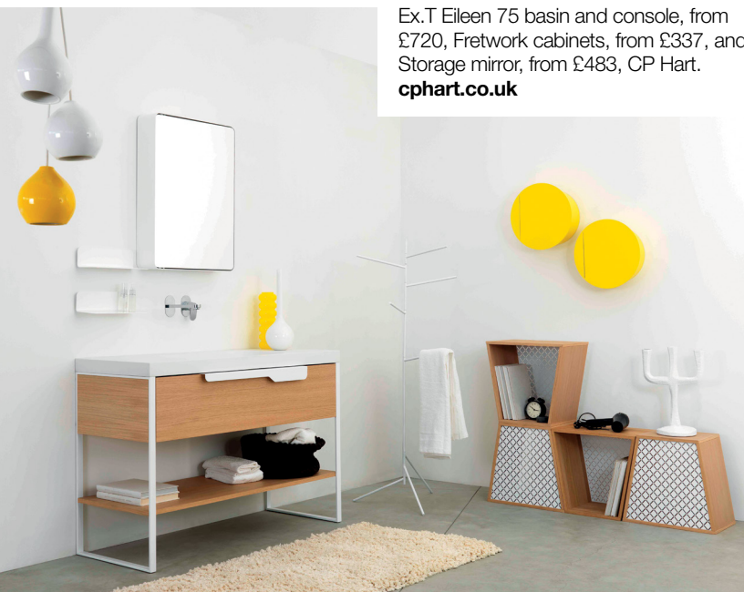
Ex.T Eileen 75 basin and console, from £720, Fretwork cabinets, from £337, and Storage mirror, from £483, CP Hart. cphart.co.uk