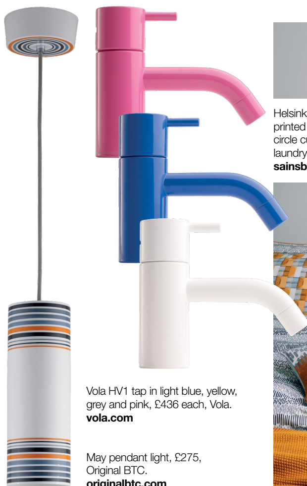
Vola HV1 tap in light blue, yellow, grey and pink, £436 each, Vola. vola.com