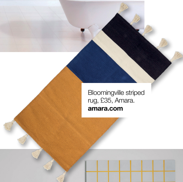
Bloomingville striped rug, £35, Amara. amara.com

A new wave of Scandi-living has arrived, and it's perfect for those who prefer a more minimalist style – simple, clean lines with just a few pops of colour – in their home. To achieve this look, start with white as a base and be selective with the number of colours you use in a room – our favourite combination is ochre yellow paired with a bold blue.