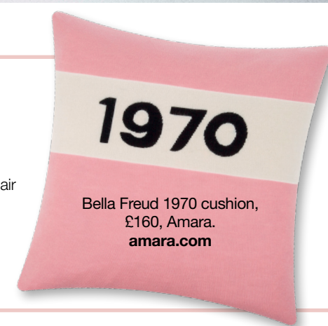
Bella Freud 1970 cushion, £160, Amara. amara.com