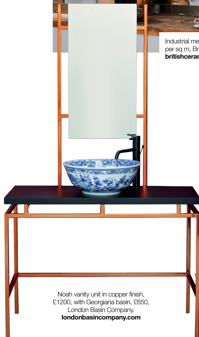
Noah vanity unit in copper finish, £1200, with Georgiana basin, £650, London Basin Company. londonbasincompany.com