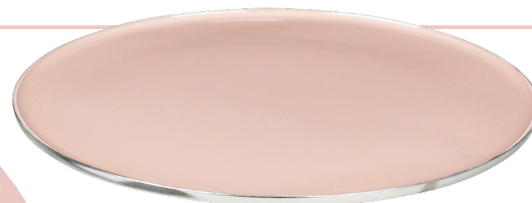
Pink tray, £19.95, Audenza. audenza.com