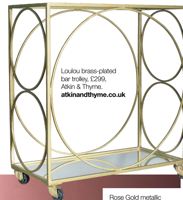
Loulou brass-plated bar trolley, £299, Atkin & Thyme. atkinandthyme.co.uk