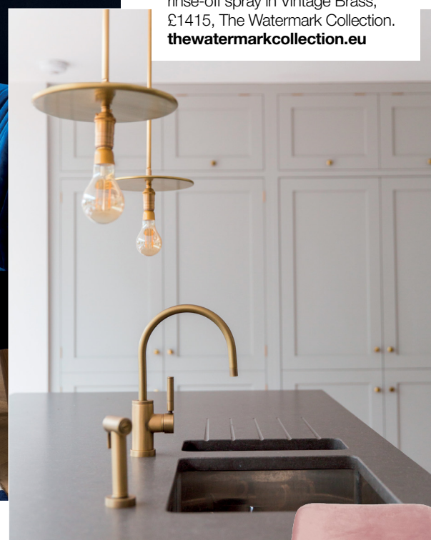
Loft deck-mounted monoblock kitchen mixer with separate pull-off rinse-off spray in Vintage Brass, £1415, The Watermark Collection. thewatermarkcollection.eu