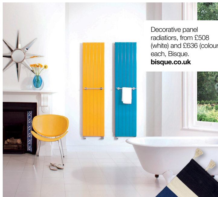
Decorative panel radiators, from £508 (white) and £636 (colour) each, Bisque. bisque.co.uk