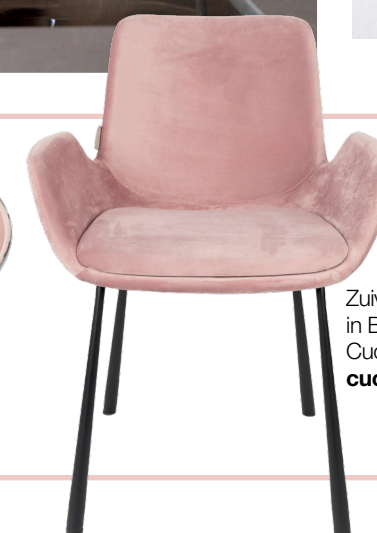
Zuiver velvet-look chair in Blush Pink, £498, Cuckooland. cuckooland.com