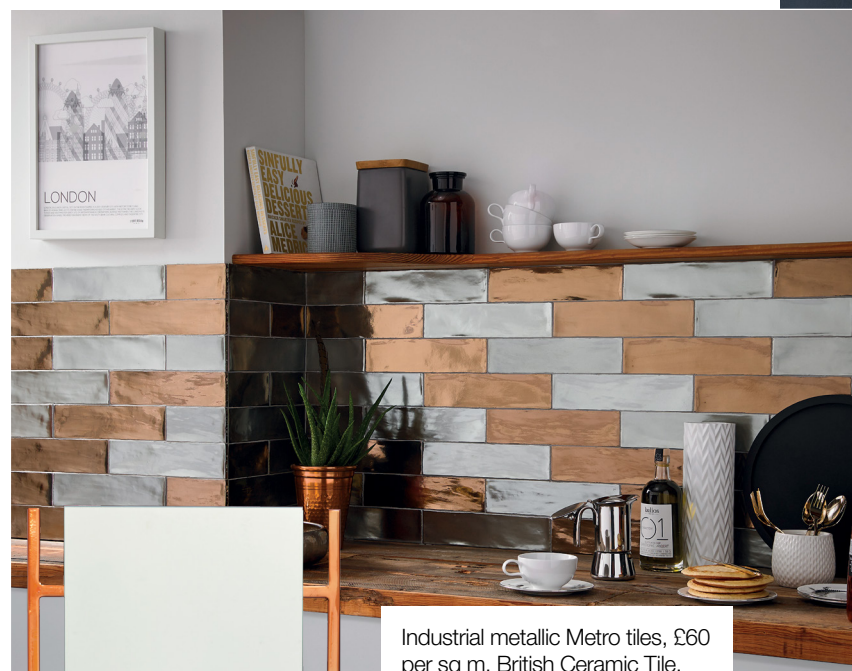
Industrial metallic Metro tiles, £60 per sq m, British Ceramic Tile. britishceramictile.com

Metallics have been big for a while now, but in 2018 this trend is set to get even bigger. And whilst brass looks to be the go-to choice, gold and rose gold are gaining more and more popularity. Don't be afraid to mix and match colours, either – layering different metallics together will create a truly dazzling look.