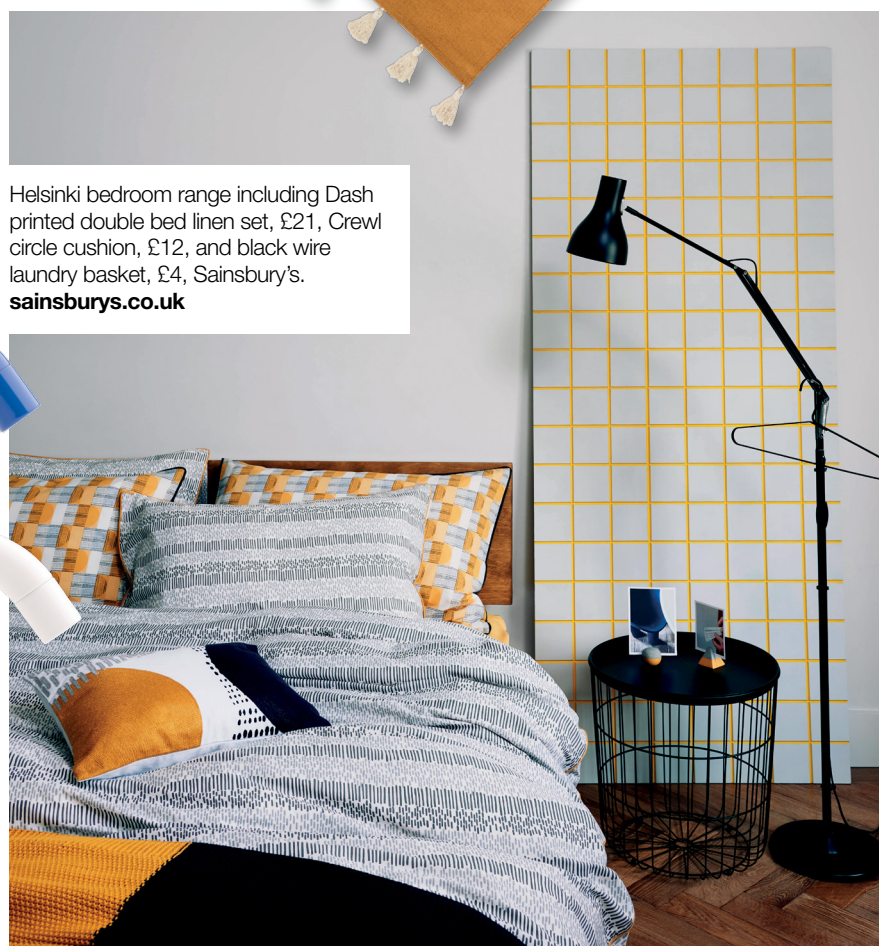
Helsinki bedroom range including Dash printed double bed linen set, £21, Crewl circle cushion, £12, and black wire laundry basket, £4, Sainsbury's. sainsburys.co.uk