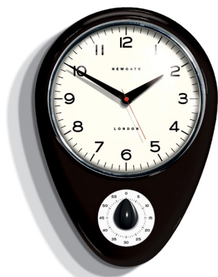
Discovery Kitchen Timer wall clock, £60, Newgate Clocks. newgateclocks.com