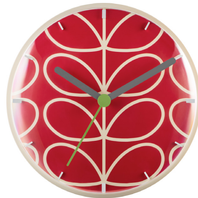
Orla Kiely Linear Stem wall clock in Geranium, £57.95, Cotswold Trading. cotswoldtrading.com