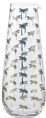
Palm print carafe, £16, Paperchase. paperchase.co.uk