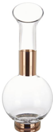
Tom Dixon tank jug, £100, Amara. amara.com

Serve up drinks as well as smiles with our pick of the latest glassware