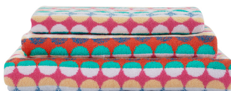
Iberia towels, from £4 for a hand towel, George Home. direct.asda.com