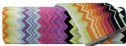
Missoni Giacomo T59 bath towel, £40, Amara. amara.com