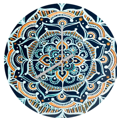
Bohemian Zen Mandala clock, £30, ArtWow. artwow.co