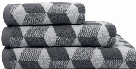
Cubus bath towels, £25 for two, Made.com. made.com