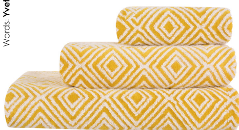
J by Jasper Conran Diamond towels, from £11 for a hand towel, Debenhams. debenhams.com