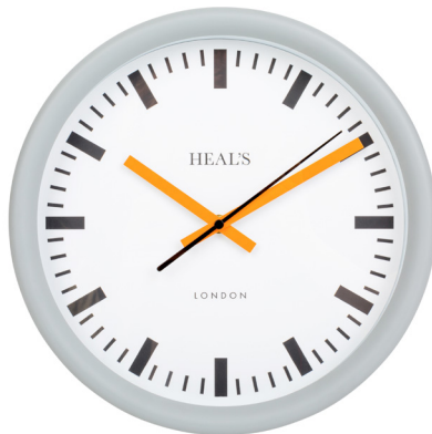
Grey and orange wall clock, £65, Heal's. heals.com