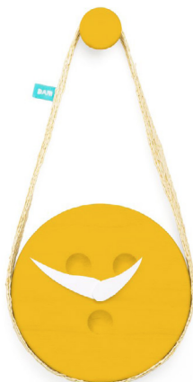
Mr. Silva clock by Dam, £125, Clippings. clippings.com