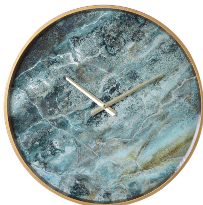
Atleigh marble-effect wall clock in blue, £56, Out There Interiors. outthereinteriors.com

Tick tock, tick tock... with summer upon us, now's the perfect time to update yours