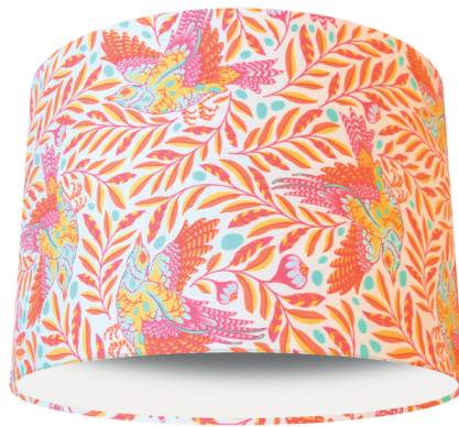
Spirit Bird lampshade, £30, Lampshade Parade.