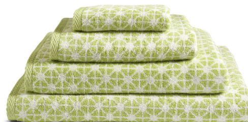
Geometric print Star towel, from £6 for a guest towel, Marks & Spencer. marksandspencer.com