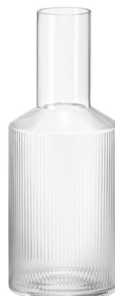
Ferm Living Ripple carafe, £31, Nest.co.uk. nest.co.uk