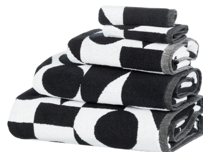
Patternity + John Lewis Reflect towels, from £8 for a face cloth, John Lewis johnlewis.com