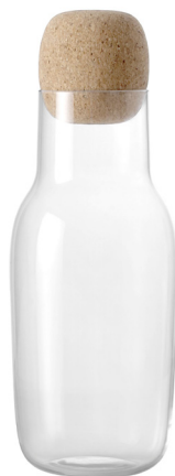
Muuto Corky carafe, £44, Rume. rume.co.uk