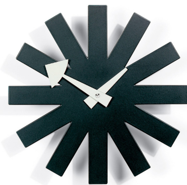
Vitra Asterisk wall clock, £209, Nest.co.uk. nest.co.uk