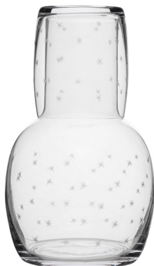
Stars carafe and tumbler set, £38, The Vintage List. thevintagelist.co.uk