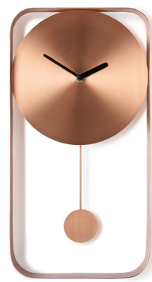
Bard pendulum wall clock in brushed copper, £39, Made. made.com