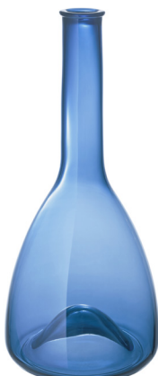
Stockholm carafe, £8, Ikea. ikea.com