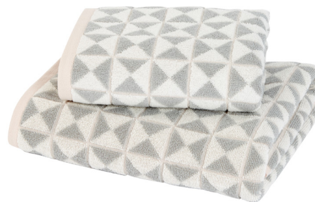
Geometric towels, from £5 for a hand towel, Matalan. matalan.co.uk