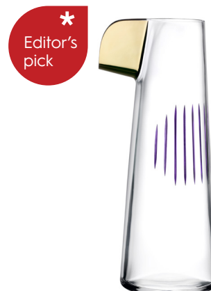
Parrot carafe by Tomas Kral, £235, Nude. nudeglass.com