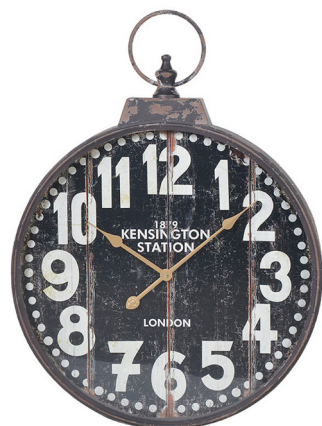
Rustic pocketwatch wall clock, £58.50, The Farthing. thefarthing.co.uk