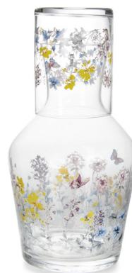
Butterfly Garden carafe and tumbler set, £26, Laura Ashley. lauraashley.com