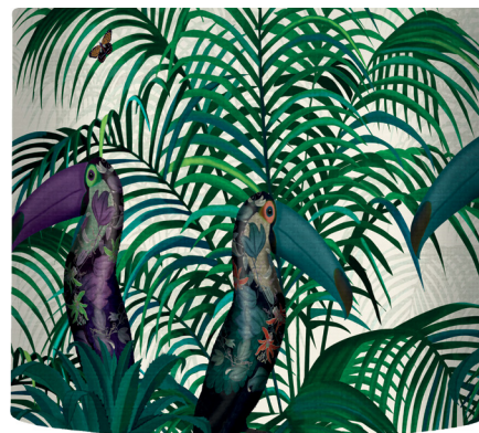
FabFunky medium Tropical Toucan drum lampshade, £125, Hill House Design.