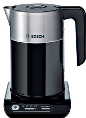
Bosch Sky kettle, £99.95, John Lewis. johnlewis.com