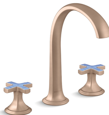
Kallista basin tap, £2019, West One Bathrooms. westonebathrooms.com