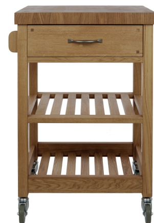
Milton oak butcher's trolley, £750, Laura Ashley. lauraashley.com