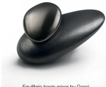
Equilibrio basin mixer by Gessi, £110, CP Hart. cphart.co.uk