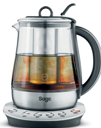
Sage STM550 Smart Tea Pot, £129.95, Amazon. amazon.co.uk