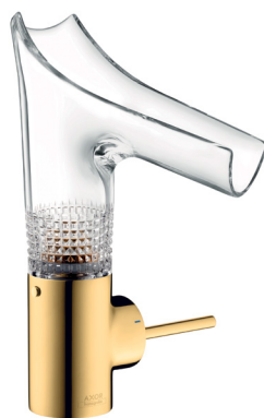
Axor Starck V basin mixer with diamond-cut glass spout, £1380, Hansgrohe. hansgrohe.co.uk