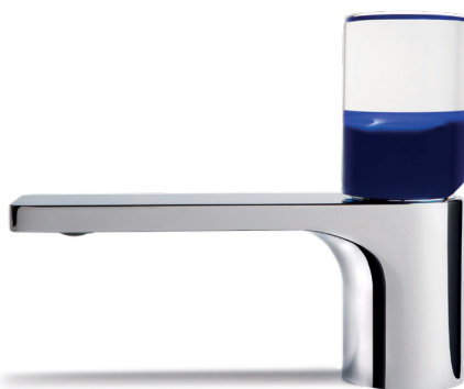
Nice faucet by Matteo Thunn, price on application, Fantini. fantini.it