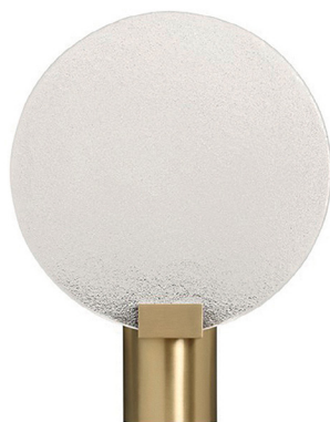
Nimbus wall light, £744, CTO Lighting. ctolighting.co.uk