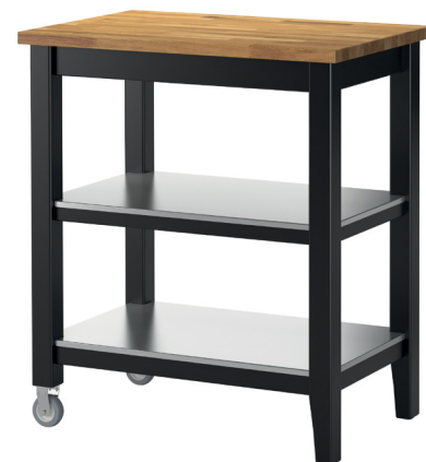
Stenstorp kitchen trolley in black-brown, £140, Ikea. ikea.com