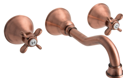
Princess Nouveau mixer in brushed copper, £260, Bagnodesign. bagnodesignlondon.com