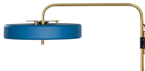
Revolve wall light in brass and matt blue, £584, Bert Frank. bertfrank.co.uk