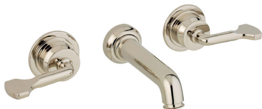
Leaewood wall-mounted lever basin mixer by Martin Brudnizki, £1278, Drummonds. drummonds-uk.com

Add a statement to your bathroom or cloakroom with a stand-out basin mixer. We've rounded up some of the coolest styles