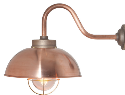
Shipyard wall light, £519, Davey Lighting. originalbtc.com