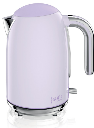
Fearne by Swan kettle in Lily, £49.99, Very. very.co.uk