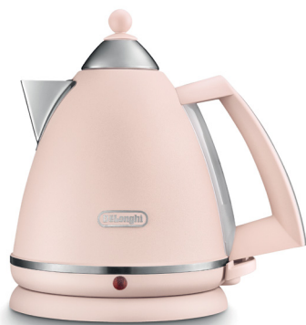
De'Longhi Argento Flora kettle in peony rose, £84.99, Sainsbury's. sainsburys.co.uk

Even the smallest appliances can pack a stylish punch. Update your worktops with our pick of the latest styles