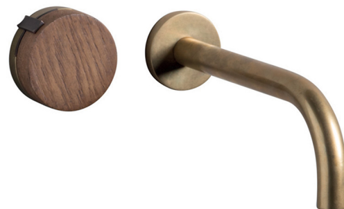
Elements basin mixer in Oxblood and Aged Brass, £1311, The Watermark Collection. thewatermarkcollection.eu