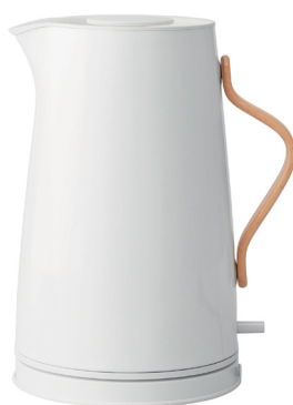
Stelton Emma kettle in chalk white, £139, Black By Design. black-by-design.co.uk