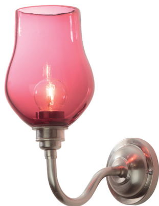
Vintage wall light, £295, Curious & Curious. curiousa.co.uk

Move over, table lamps – here are our favourite wall-mounted styles to add a modern twist to your bed side