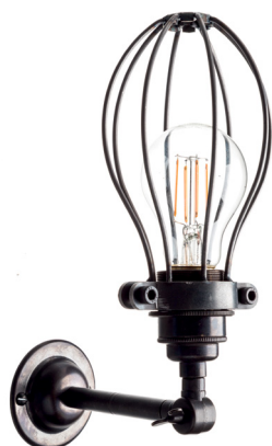
Maria Banjo caged wall light, £168, Urban Cottage Industries. urbancottageindustries.com