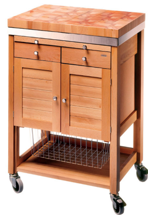
Eddingtons Pewsey butcher's trolley, £849, John Lewis. johnlewis.com