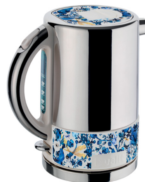
Architect kettle with Kit Miles Biophilia panel pack, £114.94, Dualit. dualit.com