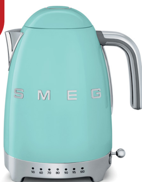
KLF04 kettle, £149.95, Smeg. smeguk.com