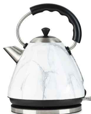
Pyramid kettle in marble, £35, Next. next.co.uk