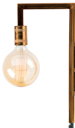
Bruno antiqued wall lamp, £125, Abode Living. abodeliving.co.uk