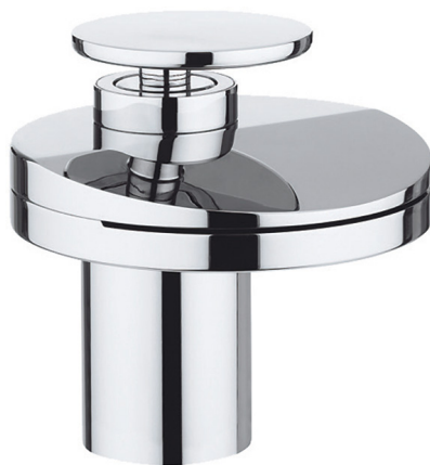
Water Circle monobloc basin tap, £409, Crosswater. crosswater.co.uk