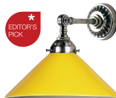
Hoolie Coolie ceramic wall light, from £134, Pooky. pooky.com