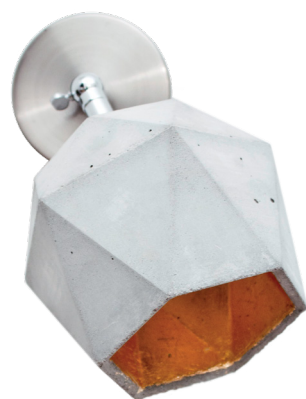
T2 wall spotlight by Gantlighting, £185, Holloways of Ludlow. hollowaysofludlow.com