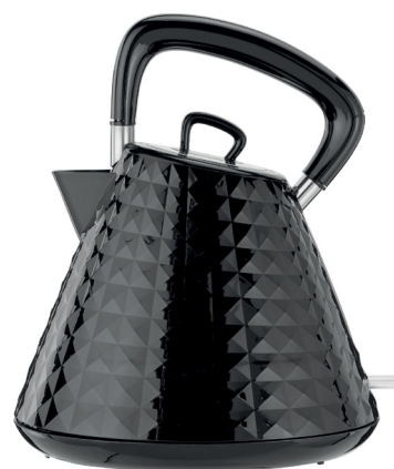
Cookworks black textured kettle, £29.99, Argos. argos.co.uk