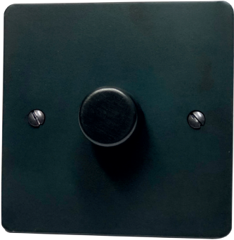
Waxed forged dimmer switch, £49, Holloways of Ludlow. hollowaysofludlow.com

Set the mood in your home with one of these stylish dimmers