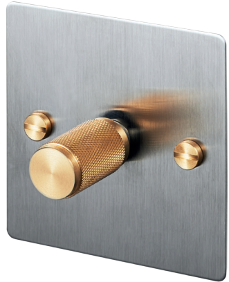
1G dimmer switch in brass and steel, £66, Buster + Punch. busterandpunch.com