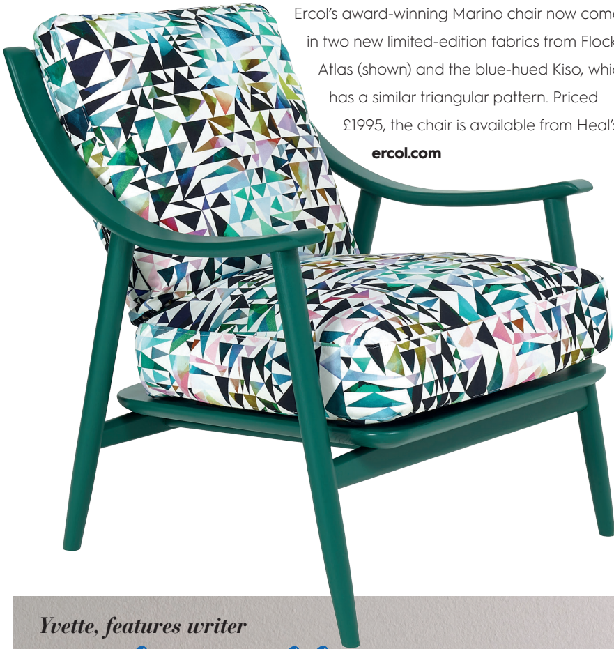
Ercol's award-winning Marino chair now comes in two new limited-edition fabrics from Flock – Atlas (shown) and the blue-hued Kiso, which has a similar triangular pattern. Priced £1995, the chair is available from Heal's. ercol.com