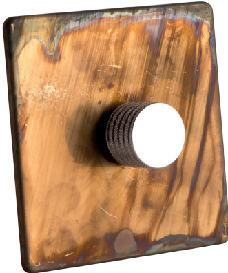
Single dimmer switch in smoked gold and silver, £3999, Dowsing & Reynolds. dowsingandreynolds.com