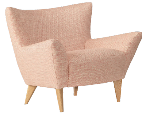
Content by Terence Conran Toros chair, £1370, Darlings of Chelsea. darlingsofchelsea.co.uk