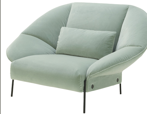
Paipai velvet angled armchair, £2465, Ligne Roset. ligne-roset.com