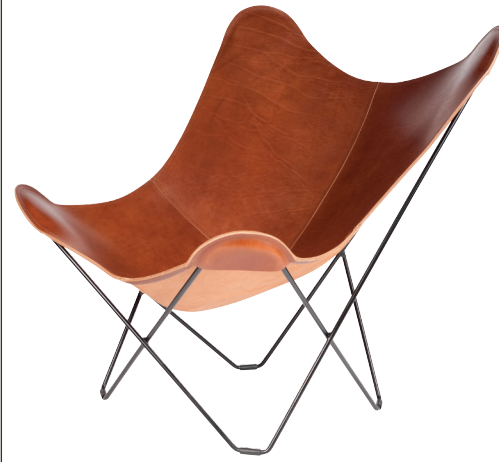
Cuero Design Pampa Mariposa leather butterfly chair, £860, Nest. nest.co.uk

Curl up with a good book on one of these relaxing seats while dinner's in the oven