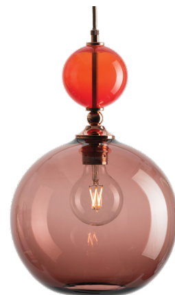
Pop light in aubergine, £550, Rothschild & Bickers. rothschildbickers.com