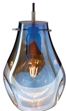
Small Soap pendant in blue, £350, Hector Finch. hectorfinch.com